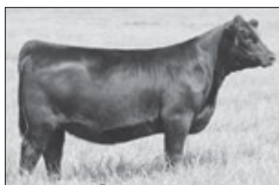
PASTURE VIEW LADY S702 - A full sister to Lot 1.