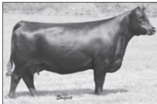
SAV ELBA 910 - The donor dam of Lots 17 through 23.