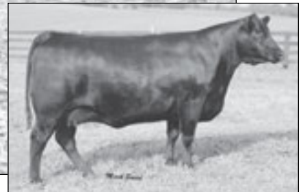
TCF RITA 7090 - The third generation dam of Lot 30.