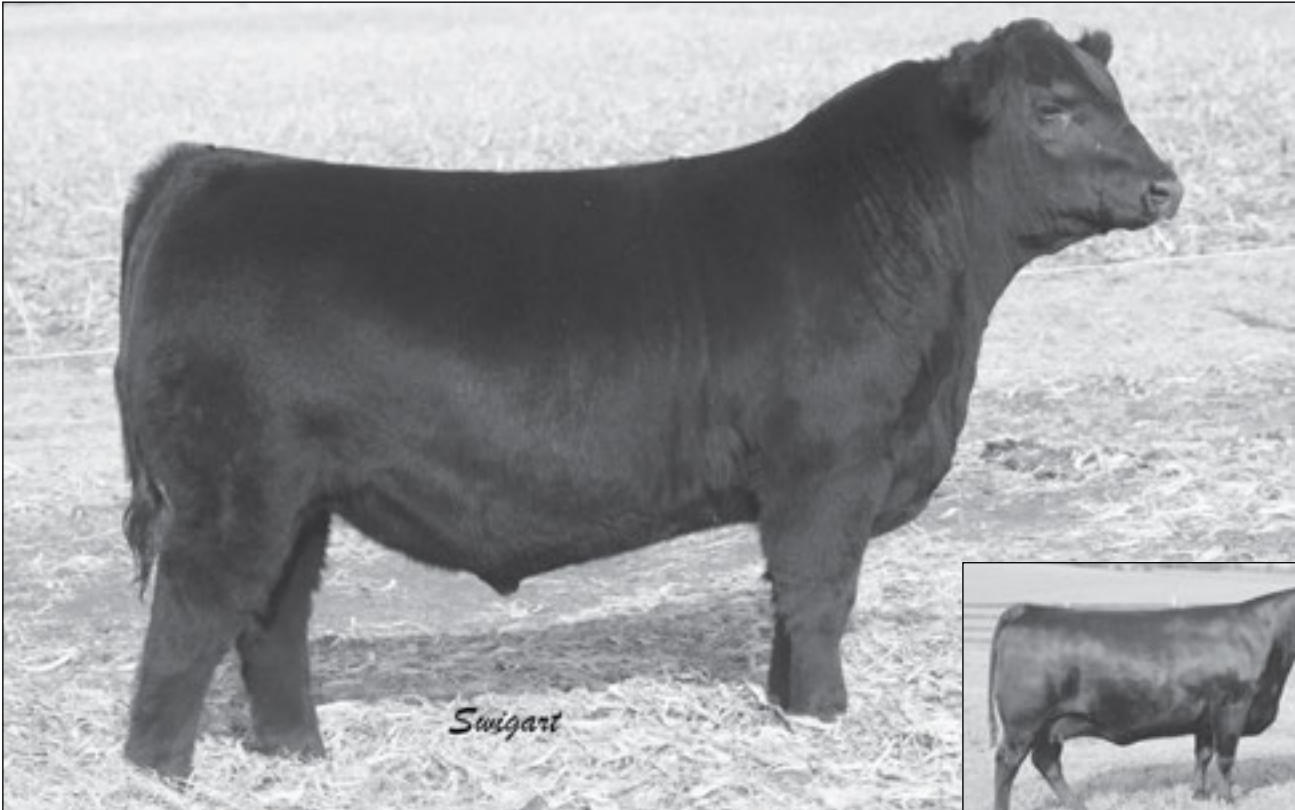
PVA INTERNATIONAL 7104 - He sells as Lot 30.