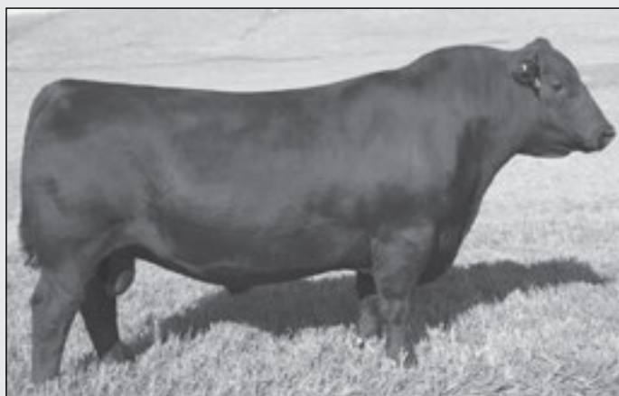
SAV SEEDSTOCK 4838 - Reference Sire C.