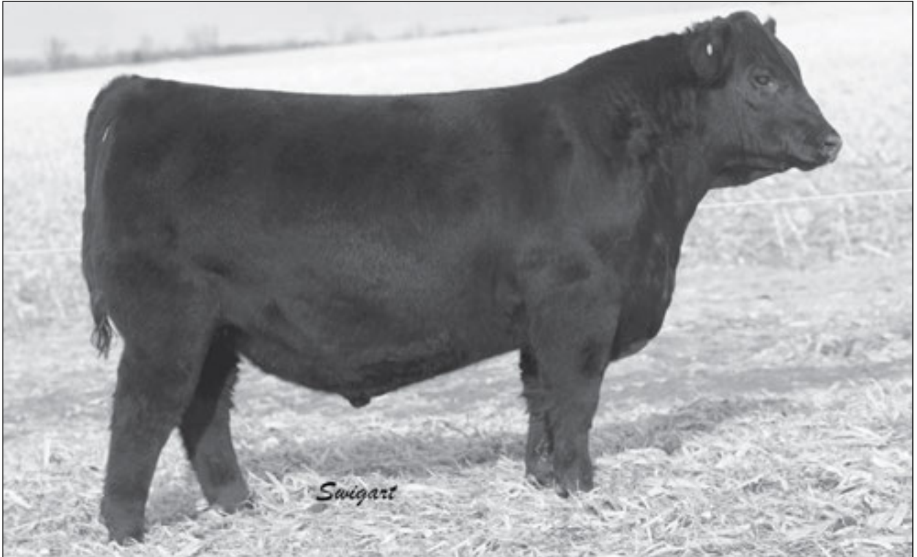
PVA SIR LANCELOT 7210 - He sells as Lot 2.