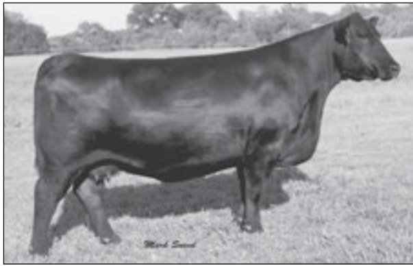
WERNER BLACKBIRD 56 - The grandam of Lot 43.