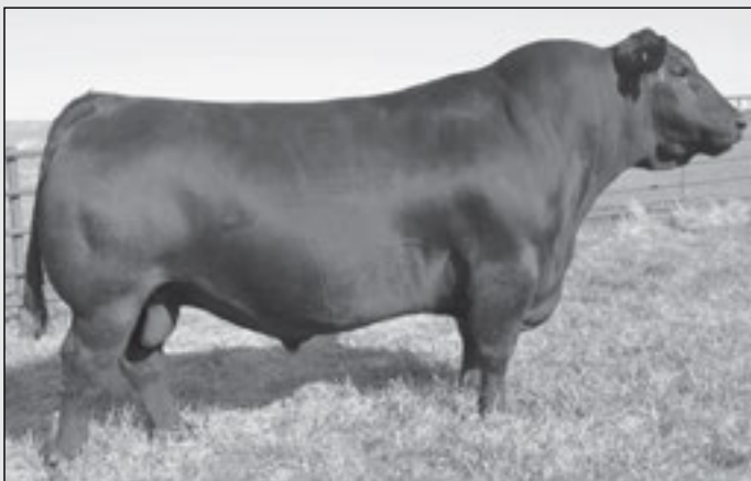
SAV RESOURCE 1441 - Reference Sire D.