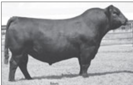
MAR INNOVATION 251 - Reference Sire I.