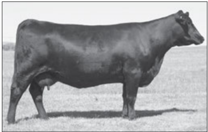
SAV MAY 2397 - Her influence sells.