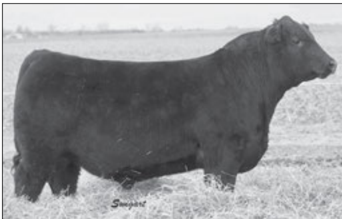
SAV RESOURCE 7156 - He sells as Lot 28.