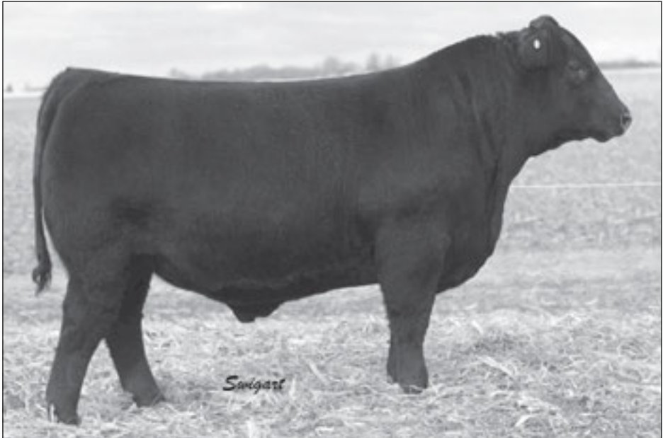
PVA MARSHALL 7508 - He sells as Lot 25.