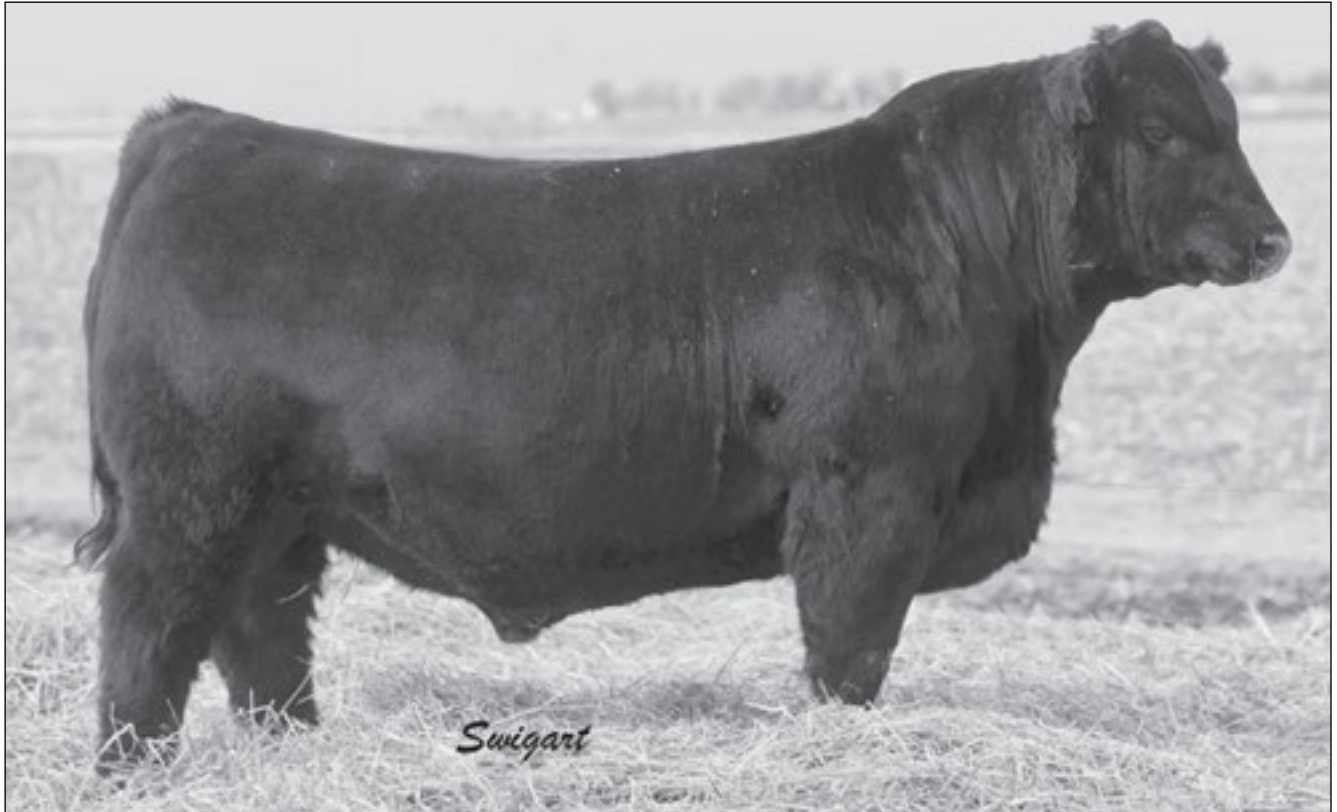
PVA SEEDSTOCK 7138 - He sells as Lot 13.