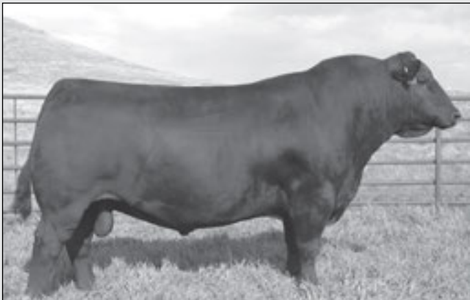
SAV ANGUS VALLEY 1867 - Reference Sire F.