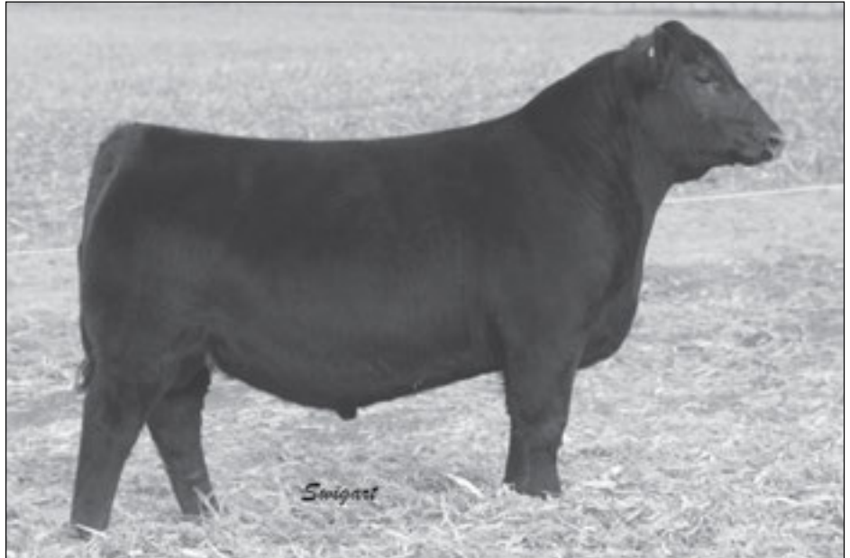
PVA COMMANDO 7925 - He sells as Lot 41.