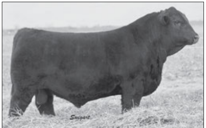
PVA SEEDSTOCK 7110 - He sells as Lot 11.