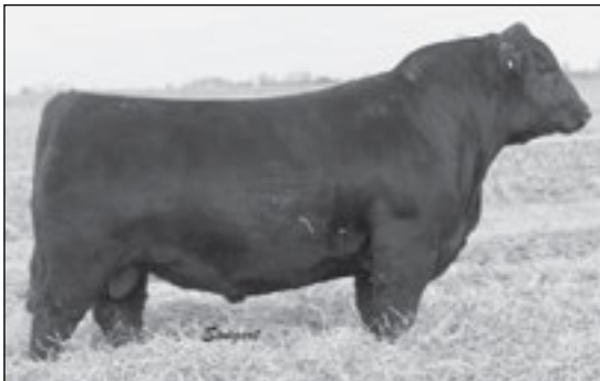
PVA IRONMAN K610 - He sells as Lot 18.