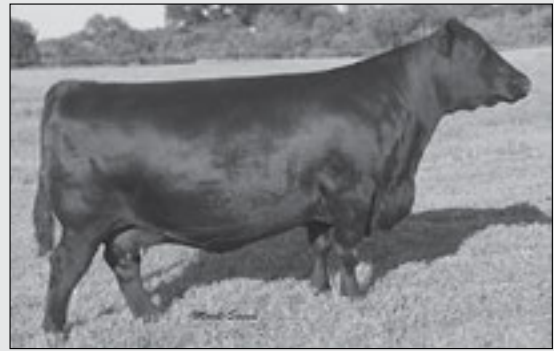
BA LADY 6807 308 - The dam of Lots 46 through 49.