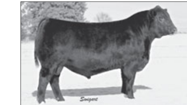
PVA CALL OF DUTY 4159 - The sire of Lot 60.

Connealy Black Granite #17028963 #Eura Elga of Conanga 9109 # Connealy Consensus 7229 # Connealy Consensus Blue Lilly of Conanga 16 #+SAV Bismarck 5682 [RDF] Eura Cal of Conanga 56B # SAV Iron Mountain 8066 #TC Gridiron 258 PVA Queen 2160 17249811 #PVA Dividend Queen 8260 SAV Madame Pride 3249 # BC Matrix 4132 PVA Dividend Queen 5260