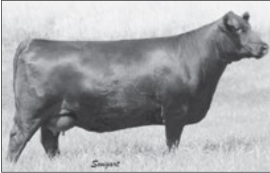
PVA BLACKCAP MAY 4197 - The dam of Lots 55 and 56.