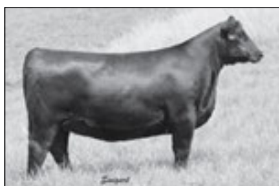
PASTURE VIEW LADY E602 - A maternal sister to Lot 1.