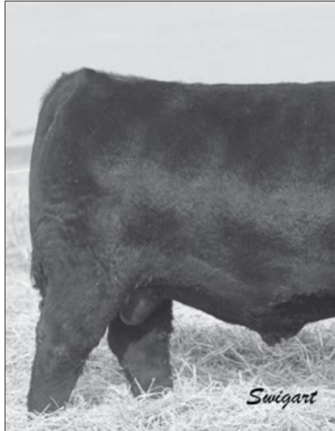
PVA ANGUS VALLEY 7143 - He sells as Lot 34.