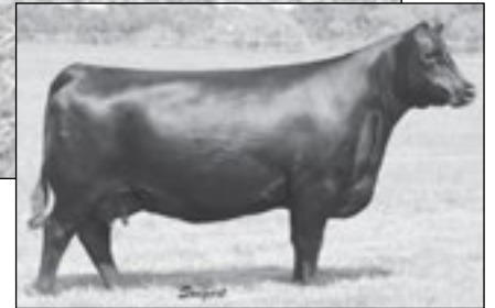
SAV ELBA 910 - The dam of Lot 24.