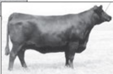
TC RUBY 9095 - The third generation dam of Lot 10.