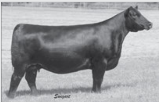
EXAR HENRIETTA PRIDE 1688 - The dam of Lots 15 and 16.