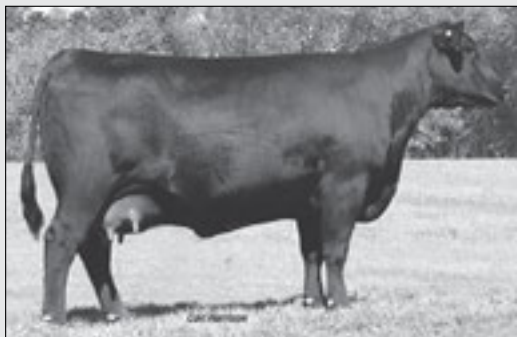
DDA BARBARA 0611 - The grandam of Lot 33.