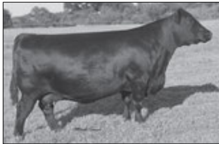
BA LADY 6807 308 - The grandam of Lot 25.