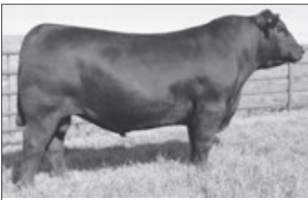
SAV TEN SPEED 3022 - Reference Sire J.