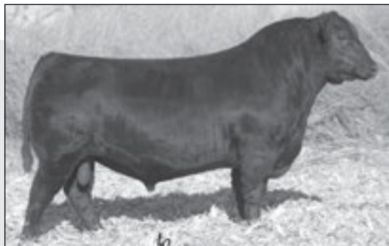
EF COMMANDO 1366 - Reference Sire G.