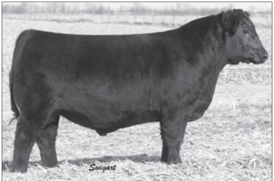
PVA OUTLAW 7959 - He sells as Lot 42.