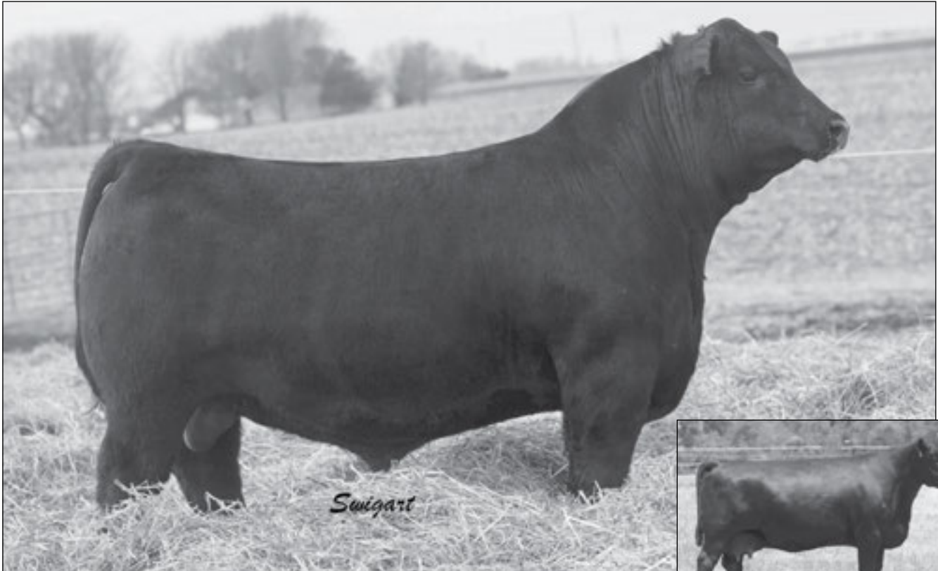
PVA FORGERY 7122 - He sells as Lot 27.