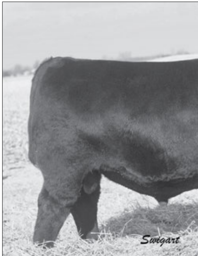
PVA RIPSAW L610 - He sells as Lot 17.