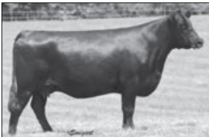
PASTURE VIEW RITA 1159 - The dam of Lot 42.