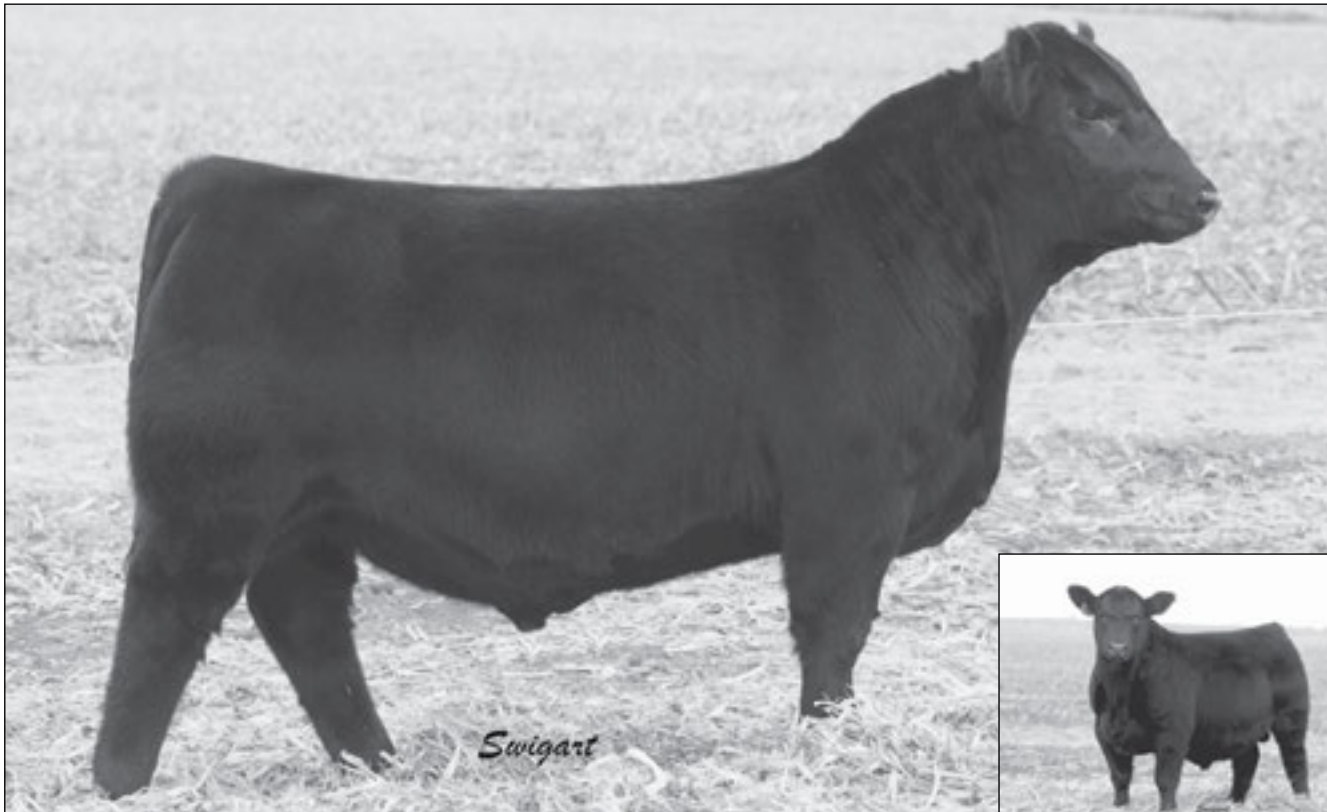
PVA SEEDSTOCK 7286 - He sells as Lot 10.