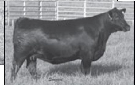
PVA LADY STANDARD Z501 - The donor dam of Lots 50 through 54.