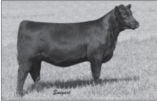
PASTURE VIEW LADY A501 - The dam of Lot 61.