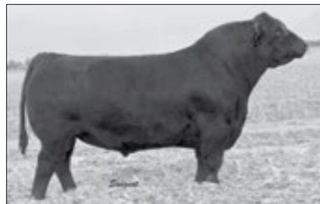
GAFFNEY GAME TIME 370 - Reference Sire M.