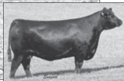
RB LADY STANDARD 305-02 - The donor dam of Lots 38 through 40.