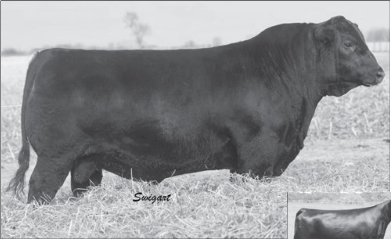
PVA WHIPLASH 6910A - He sells as Lot 24.