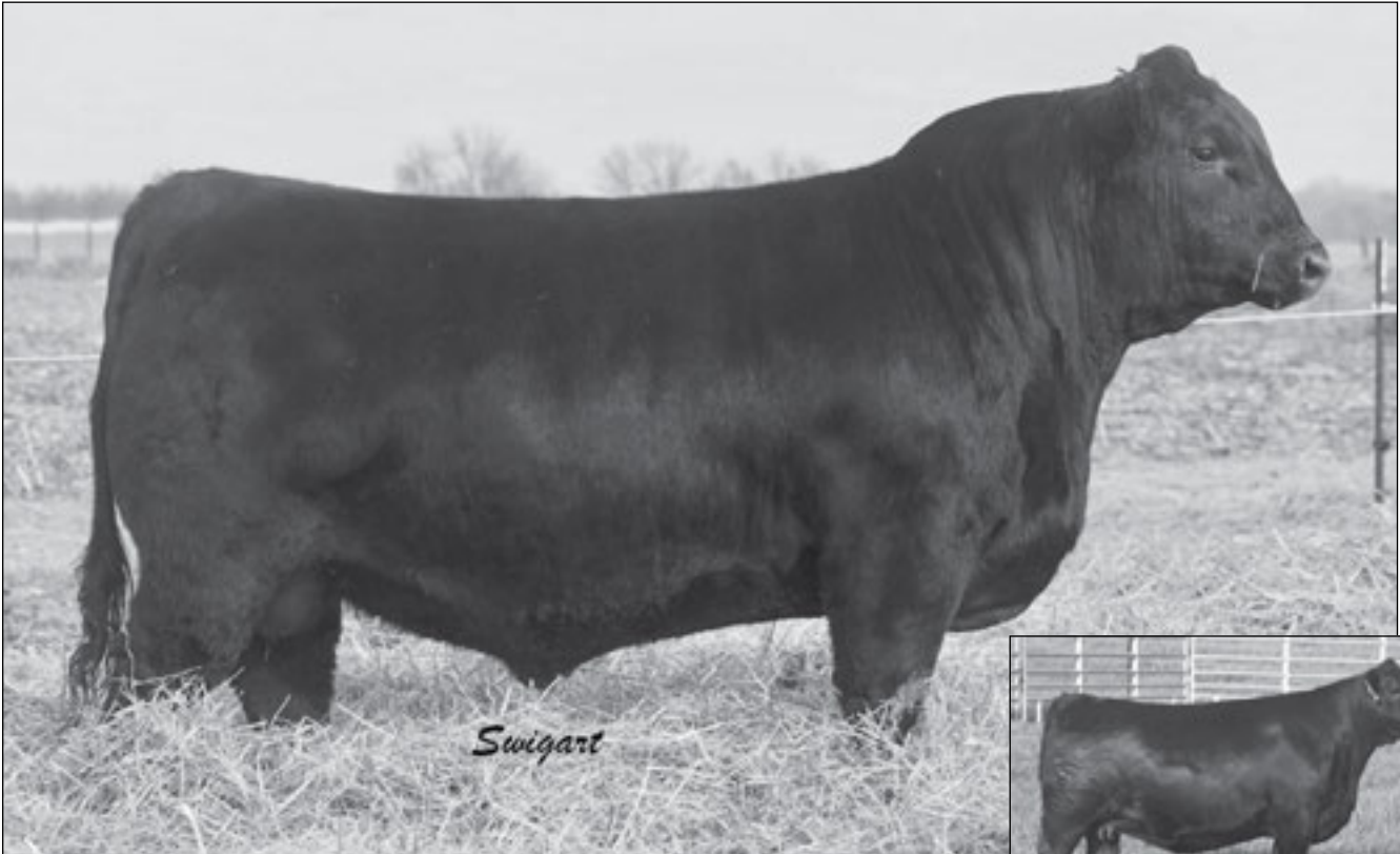
PVA INNOVATION B601 - He sells as Lot 50.