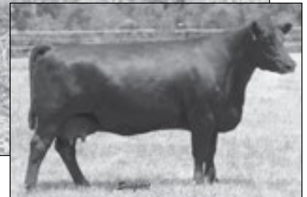
PVA MISSIE 9122 - The grandam of Lot 27.