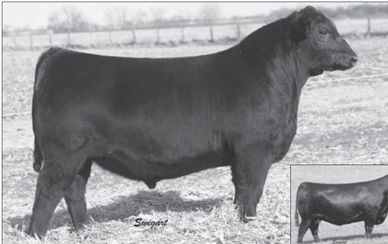
PVA SLINGSHOT K702 - He sells as Lot 39.