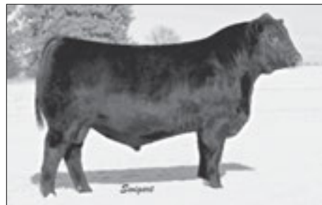
PVA CALL OF DUTY 4159 - Reference Sire L.