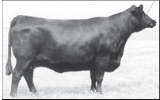
TC RUBY 9095 - The Pathfinder third generation dam of Lot 58.