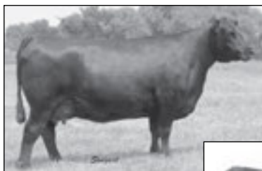
PVA RUBY 9197 - The dam of Lot 10.