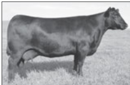
SAV BLACKCAP MAY 4136 - Paternal grandam of Lot 26.