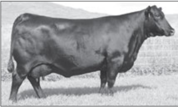
SAV ELBA 1094 - The grandam of Lots 31 and 32.