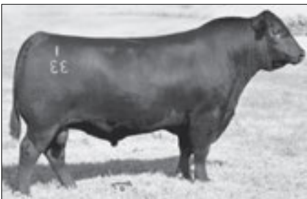
CONNELY BLACK GRANITE - Reference Sire K.