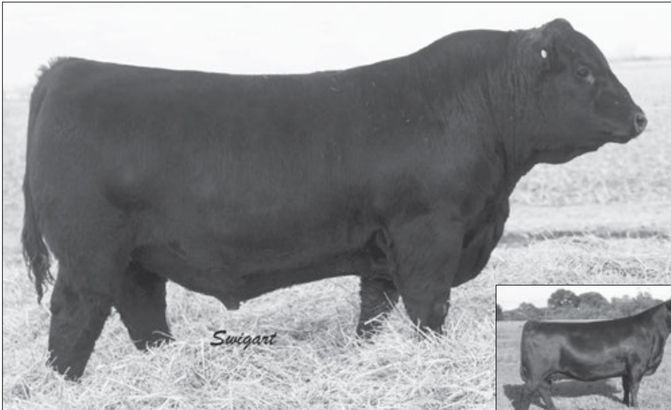
PVA RIFLEMAN 6809 - He sells as Lot 6.