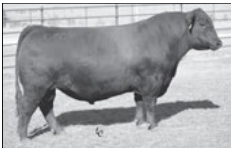
TOMBSTONE 050 - Reference Sire H.