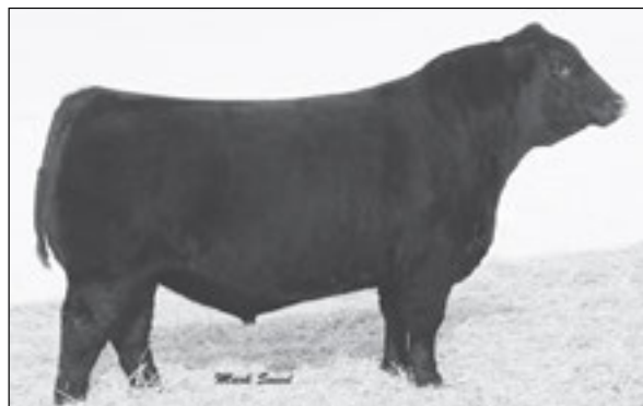
RB ACTIVE DUTY 010 - A full brother to the dam of Lot 1.