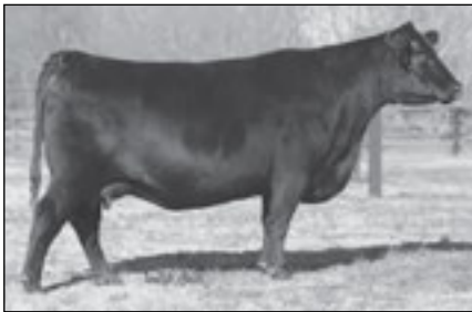
BRITT TIFFANY 025 - The dam of Lot 41.