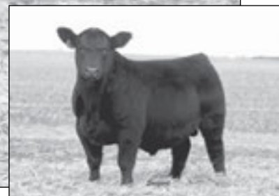
PVA SEEDSTOCK 7286 - He sells as Lot 10.