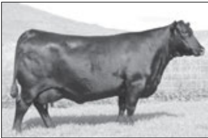
SAV ELBA 1094 - The grandam of Lots 17 through 23.