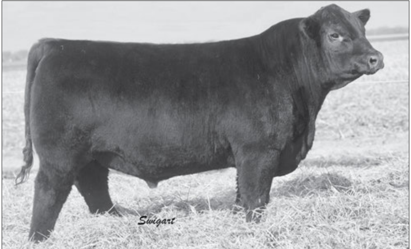
PVA RENEGADE 6983 - He sells as Lot 4.