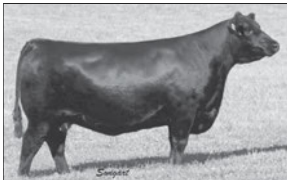
RB LADY STANDARD 305-02 - The donor dam of Lot 1.