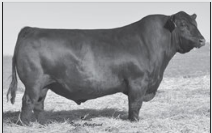
BASIN PAYWEIGHT 1682 - Reference Sire A.