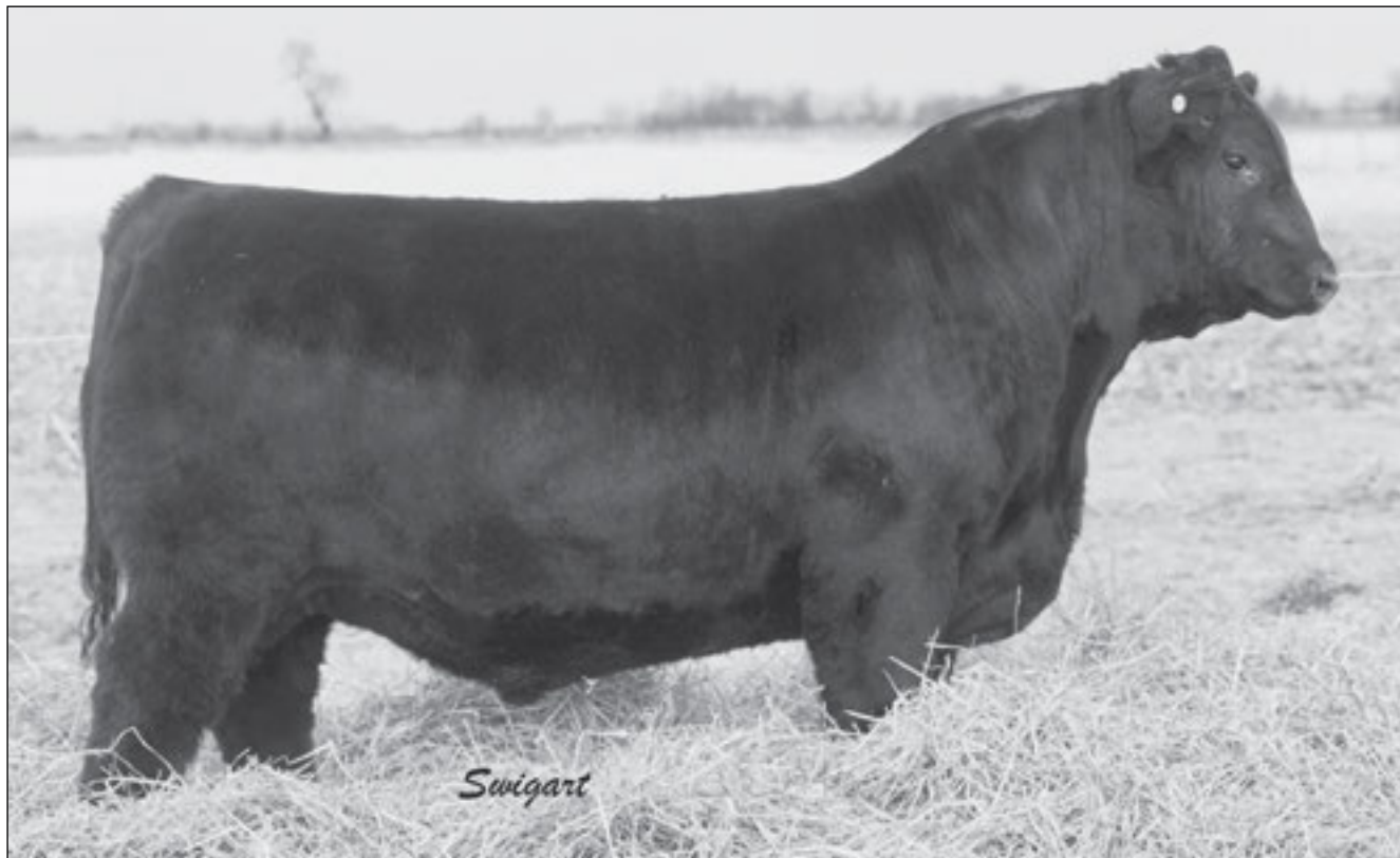
PVA HOUDINI T702 - He sells as Lot 1.