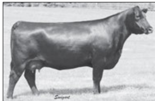
SAV ELBA 1810 - A full sister to the donor dam of Lots 17 through 23.