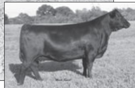
PVA MATRIX 8273 - A maternal sister to the dam of Lot 9.