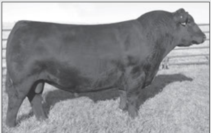
SAV INTERNATIONAL 2020 - Reference Sire E.