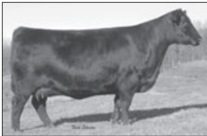
SAV ELBA 7099 - The third generation dam of Lots 17 through 23.