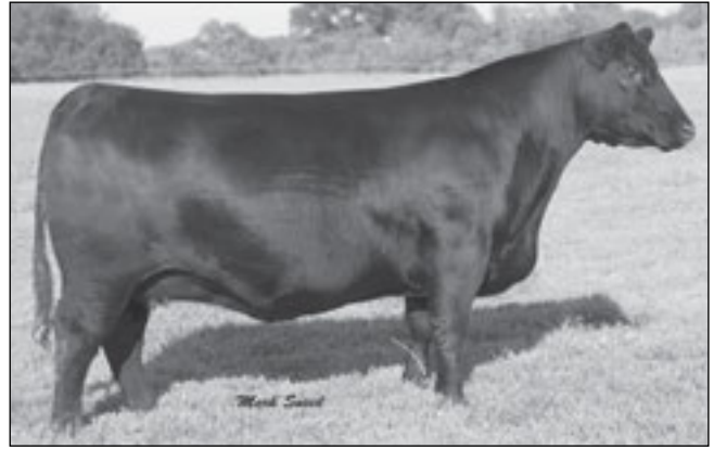
BAF TRAV 004 BLACKCAP 7284 - The grandam of Lot 64.