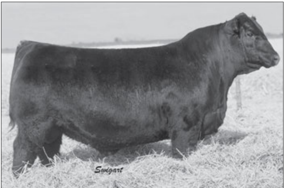
PVA RESOURCE 7107 - He sells as Lot 26.