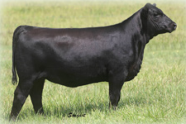
PVA BLACKCAP MAY 8597 - Lot 5A