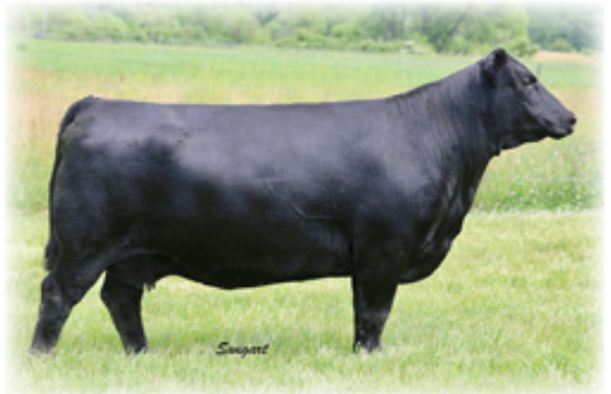
PVA BLACKCAP MAY 4197 - Lot 2