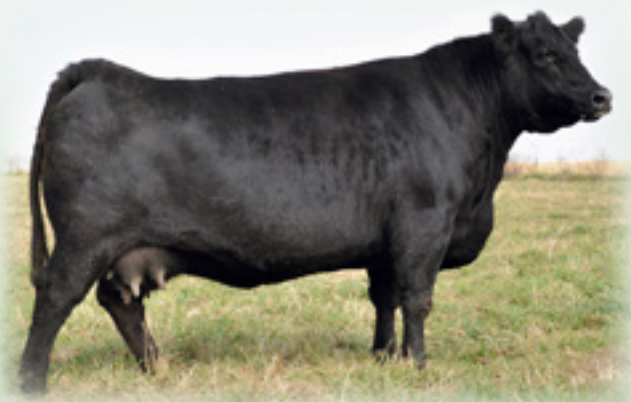
SOUTHERN BLACKCAP 2114 4683 - Dam of Lot 182 and grandam of Lot 183.