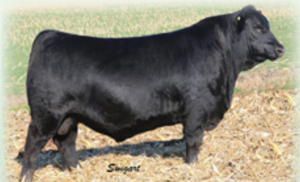
PVA RESOURCE 5142 - $13,500 son of Lot 218.