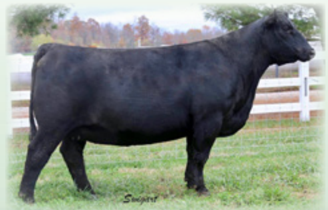
SAV BLACKCAP MAY 1234 - Dam of Lot 9.