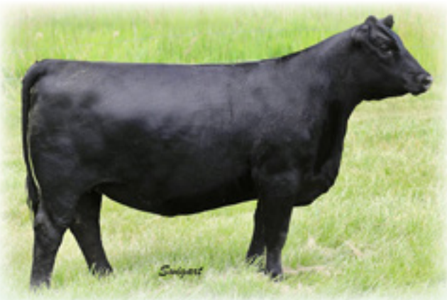
PVA EMBLYNETTE A881 - Lot 46