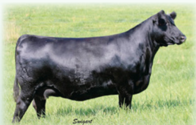
SAV EMBLYNETTE 4603 - This daughter of Reference Sire A sells as Lot 42.