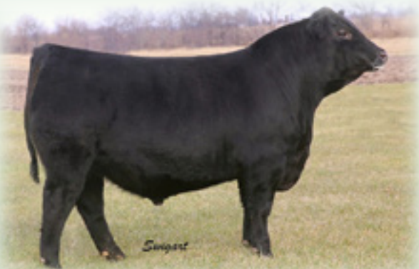
PVA HIGH NOON G445 - $10,500 maternal brother to Lots 17, 17A and 17B and flush brother to the dam of Lot 19.