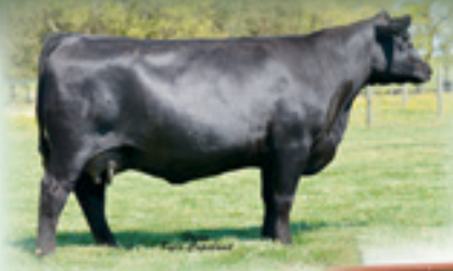
PVA LADY STANDARD 2500 - Dam of Lot 78.