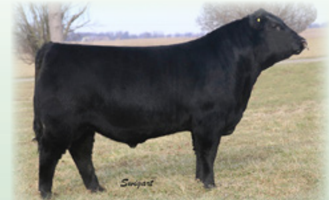
PVA WEST RIM 3913 - $12,750 maternal brother to the dam of Lot 197.