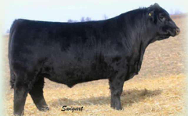
PVA IRONSIDE 6184 - $13,500 son of Lot 173.