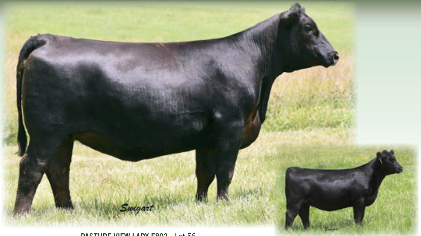
PASTURE VIEW LADY E802 - Lot 56