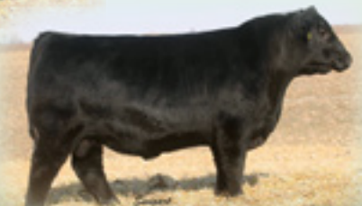
PVA GRENADE 6125 - $8,000 son of Lot 37.