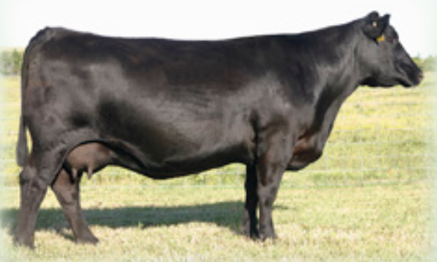
SAV EMBLYNETTE 1181 - Pathfinder Dam of Lots 44 and 45.