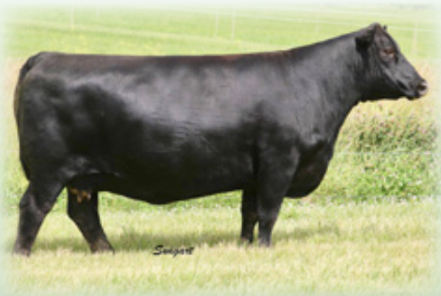
PVA EMBLYNETTE 2181 - Lot 45