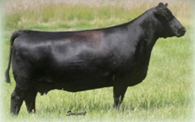
BOYD ELBA 2152 - Dam of Lots 33 and 33B.