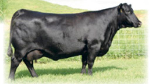
SAV ELBA 1094 - Dam of Lots 21 and 28.

• This cow is from the successful mating of the $17,500 Pathfinder Sire SAV Net Worth 4200 with the legendary SAV Elba 1094 who has generated more than $1.5 million in progeny sales-to-date.