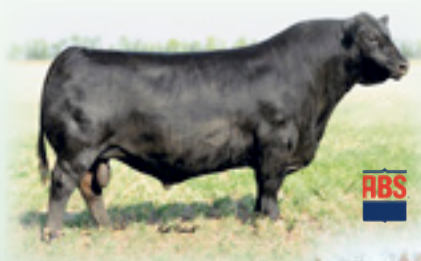
SAV HESSTON 2217 - $130,000 maternal brother to Lot 42.