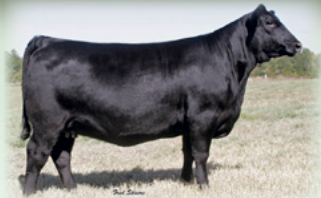
CHAMPION HILL PHYLIS 7159 - Dam of Lots 120, 121 and 122.

120 PASTURE VIEW PHYLIS A659 Birth Date: 1-23-2016 Cow +*18446718 Tattoo: A659 #*LCC New Standard #Bon View New Design 1407 (RFI) RB Active Duty 010 LCC Sunset K3118 #+*16718300 +*BA Lady 6807 305 #Vermilion Dateline 7078 +GD Lady Hi Flyer 302