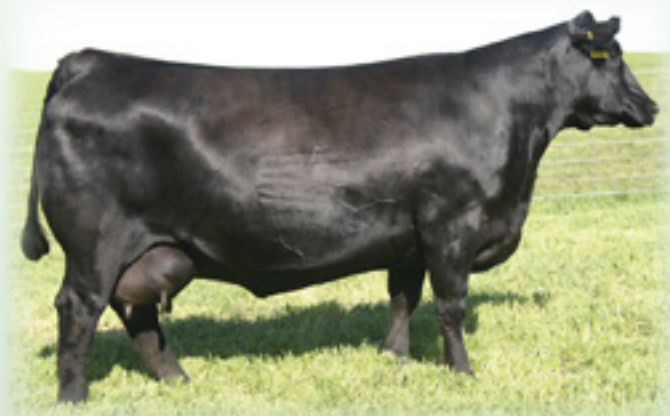
SAV EMBLYNETTE 3301 - Dam of Lot 42.