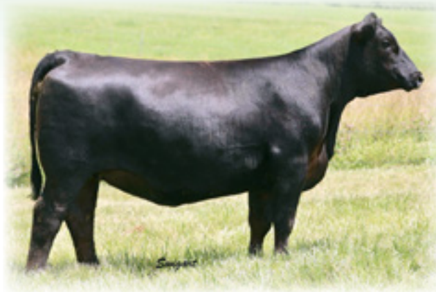
PASTURE VIEW LADY E802 - Lot 56