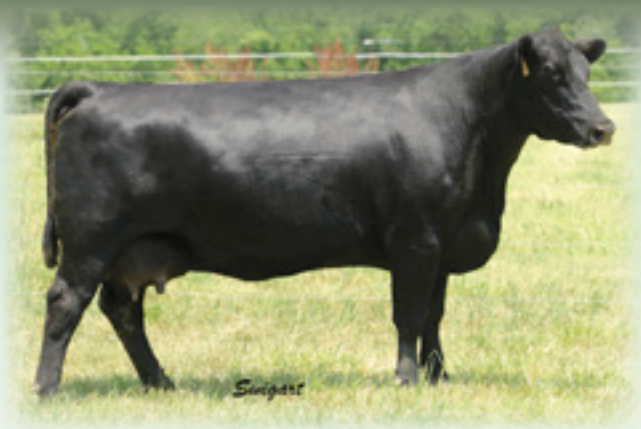
PVA MISSIE 9122 - Lot 127