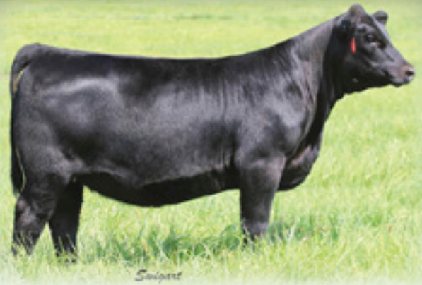
PASTURE VIEW LADY S702 - Lot 61

• Bred to calve March 4, 2020 to SAV TURBOCHARGER 6882. Exposed to SAV RAINSTORM 8223 from May 26, 2019 to July 2, 2019.