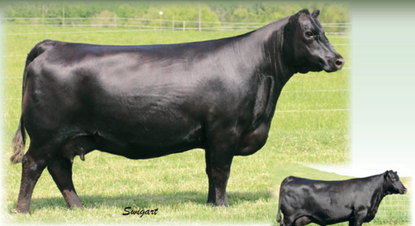
SAV ELBA 910 - Lot 21