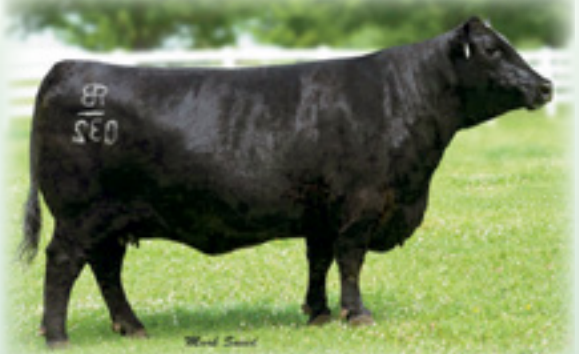
RB LADY NET WORTH 308-032 - $22,000 dam of Lot 111, with 19 maternal sisters selling.