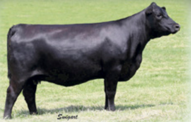
PASTURE VIEW LADY D308 - Lot 82