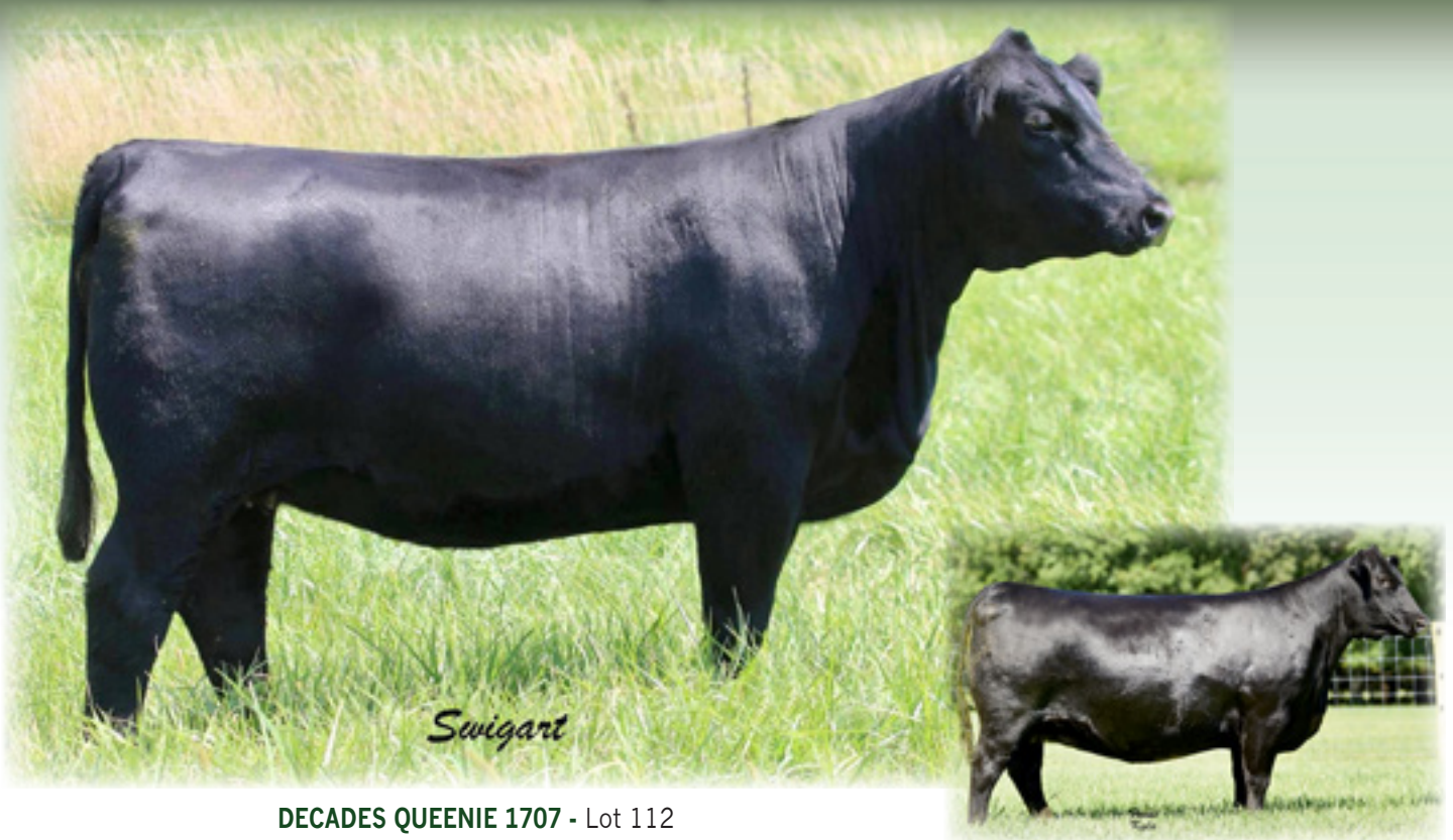
DECADES QUEENIE 1707 - Lot 112