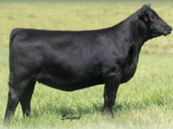
PASTURE VIEW LADY 8508 - $7,000 daughter of Lot 101.