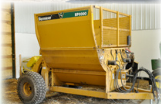
Vermeer BP8000 bale processor