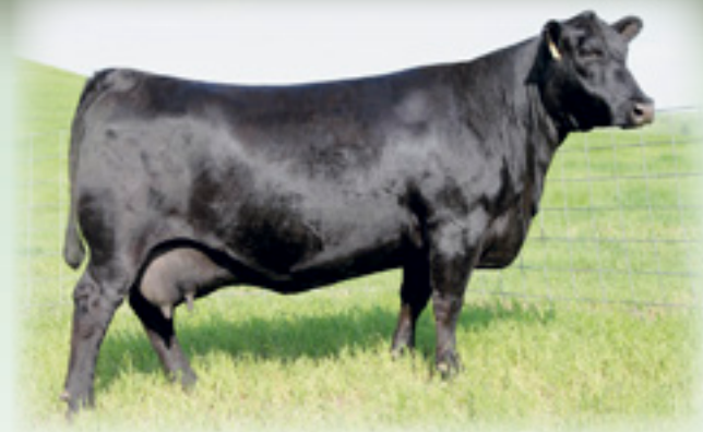
SAV ELBA 5383 - Dam of Lot 35.