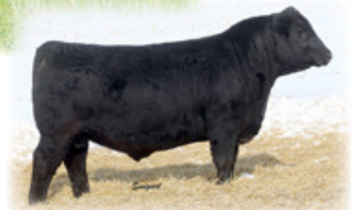
PVA RESOURCE B803 - This son of Lot 42 is a full brother to Lots 42A and 42B.