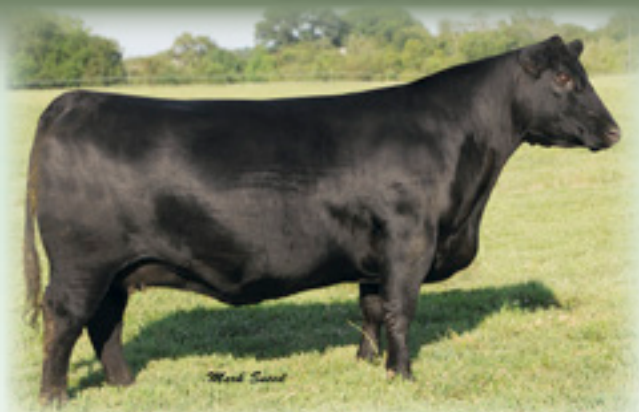
BAF TRAV 004 BLACKCAP 7284 - Dam of Lots 171-175 and 179.