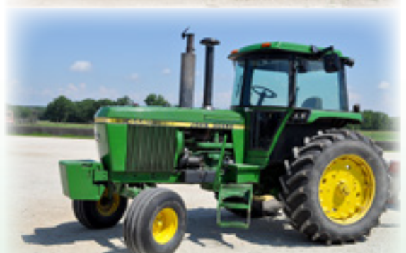
John Deere 4440 2wd tractor