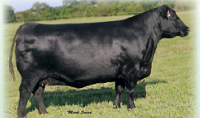
NER LUCY 3807 - Dam of Lot 144 and grandam of Lot 145.