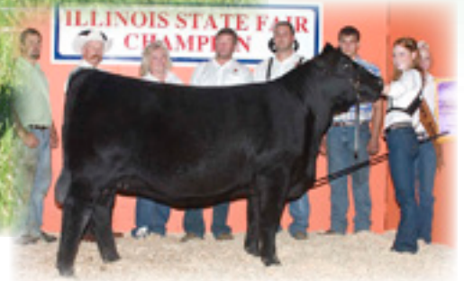
CF TOP LINE LADY 814 - Full sister to Lot 118.