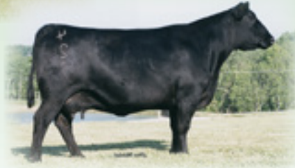
VDAR LUCY 427 - $60,000 third dam of Lot 144.