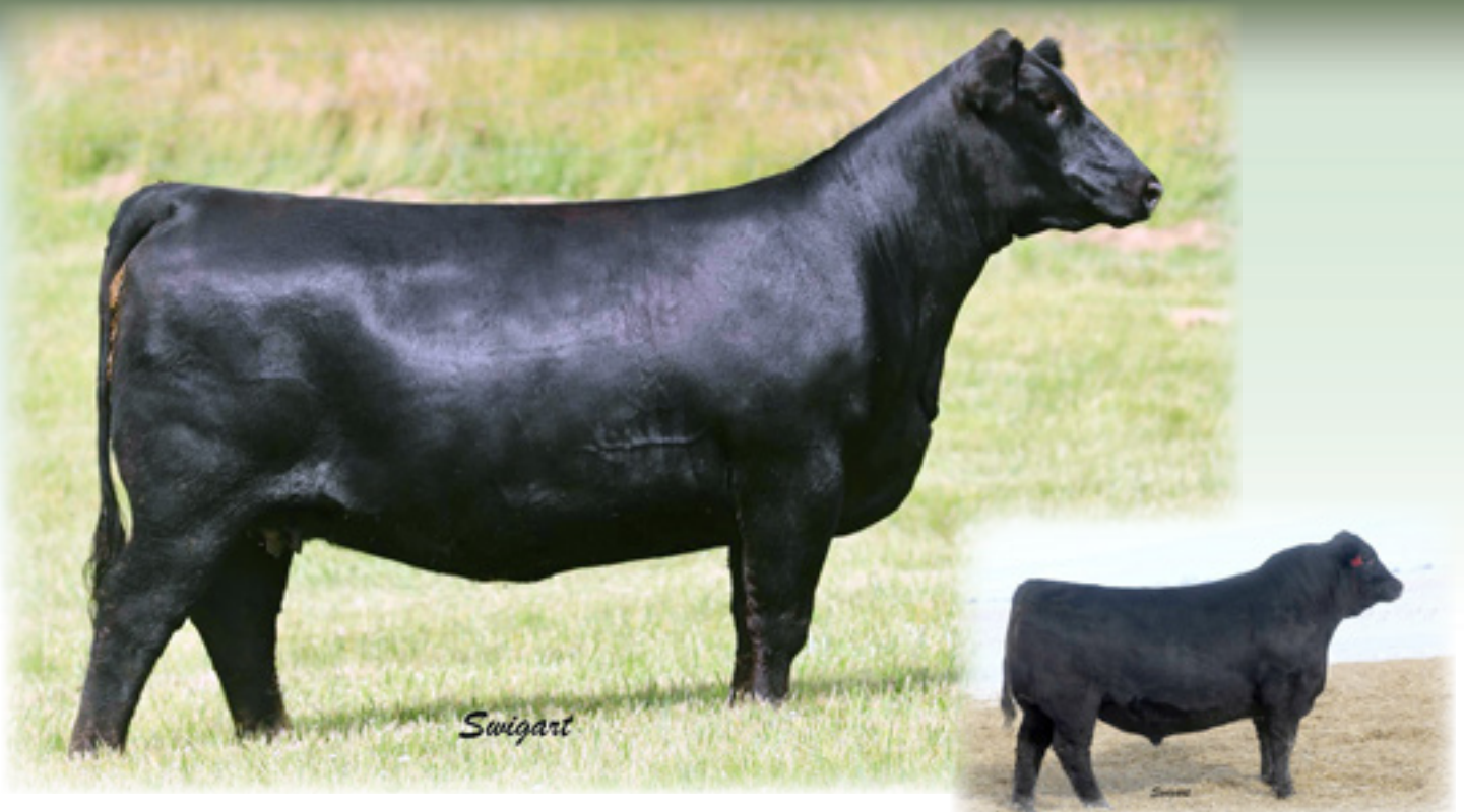
PVA BLACKCAP MAY 797B - Lot 4

PVA MCGRAW 797A - This son of Lot 2 is a full brother to Lot 4 and a maternal brother to Lots 2A-3E and 5.