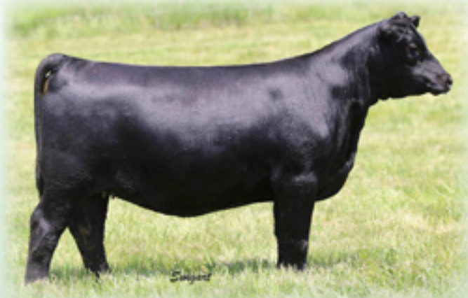
PVA BLACKCAP MAY 8797 - Lot 10A