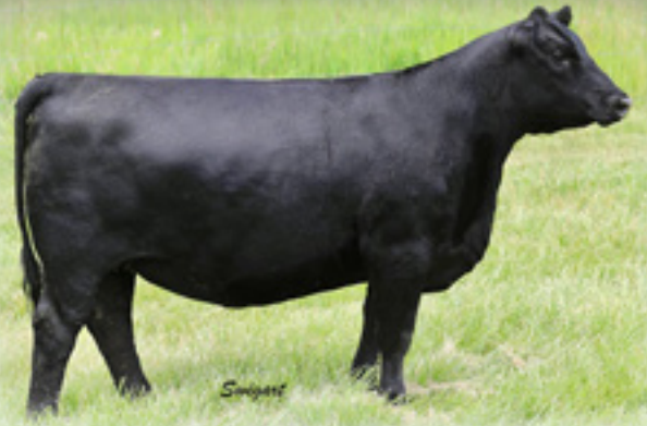
PVA EMBLYNETTE A881 - Lot 46

Bred to calve January 10, 2020 to SAV RAINDANCE 6848. Exposed to SAV RAINSTORM 8223 from May 7, 2019 to July 2, 2019. Examined safe.