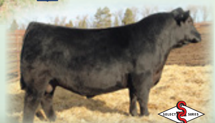
SAV DROVER 5611 - Maternal brother to Lot 42.