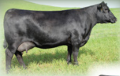
SAV EMBLYNETTE 7749 - $350,000 maternal sister to Lot 51.