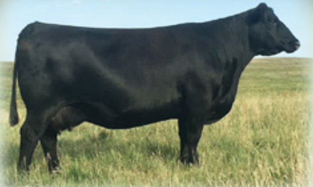
SAV EMBLYNETTE 3542 - Flush sister to Lot 44.