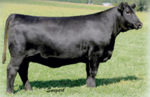
PASTURE VIEW BLACK MISS 4170 - Daughter of Lot 219.