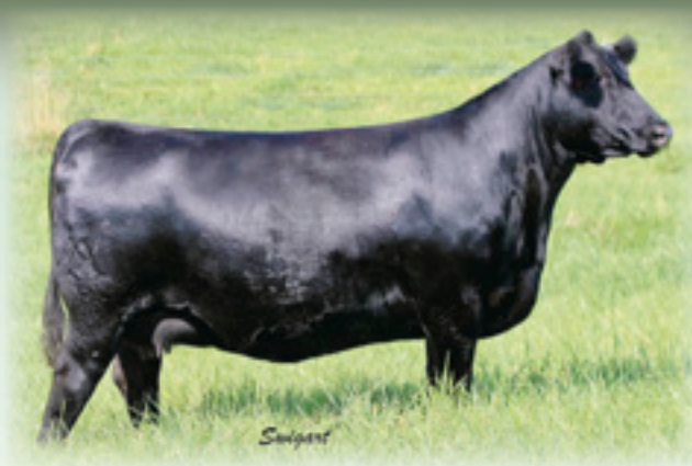
SAV EMBLYNETTE 4603 - Lot 42