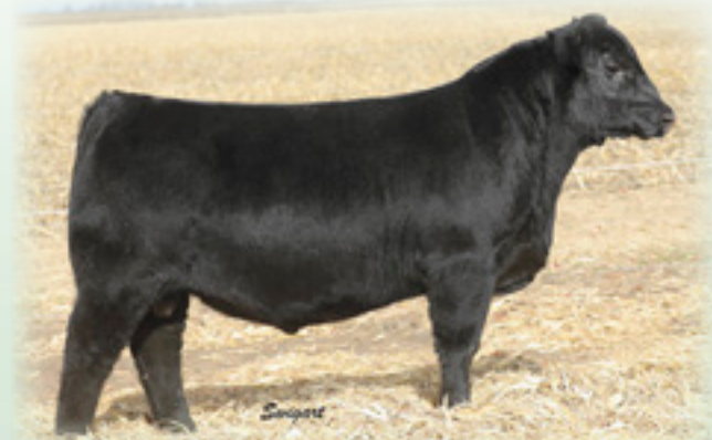
PVA ACTIVE DUTY 7930 - $10,000 son of Lot 34.