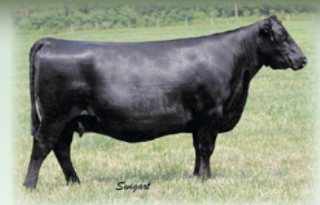
SAV ABIGALE 7001 - $25,000 dam of Lot 38.