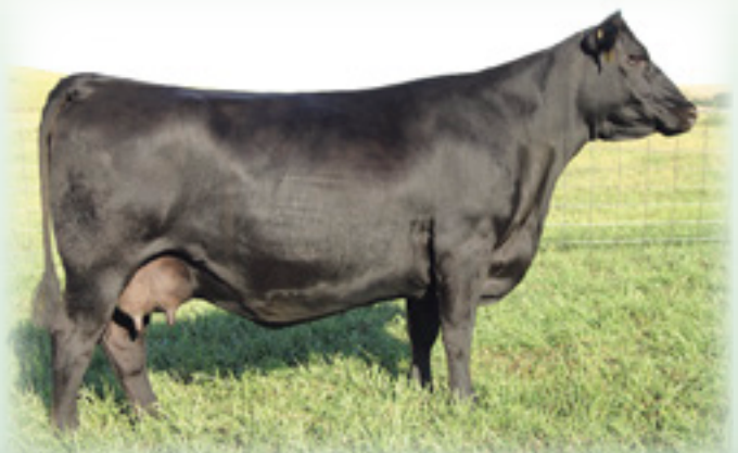
SAV ERICA 9439 - Grandam of Lot 53.