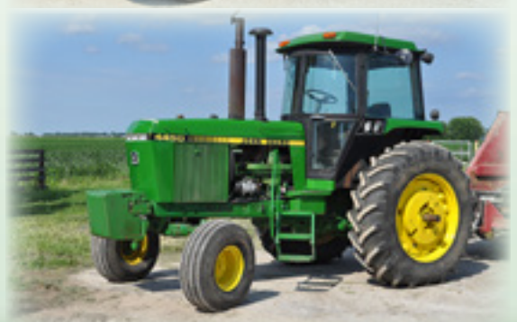
John Deere 4450 2wd tractor