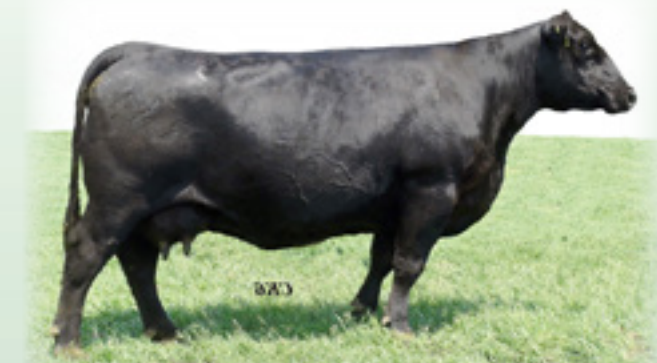
BA LADY 6807 305 - Featuring her influence.