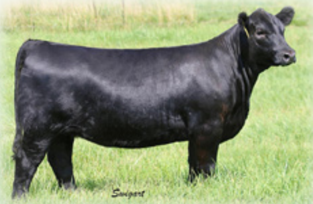
PVA BLACKCAP MAY H697 - This $9,500 daughter of Lot 2 is a flush sister to Lot 5 and a maternal sister to Lots 2A-4.