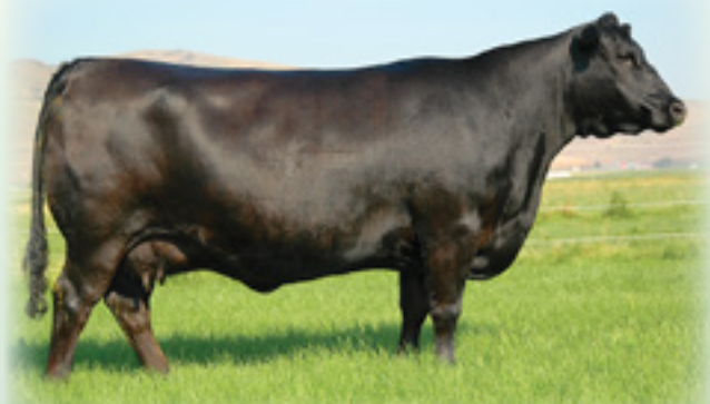
SINCLAIR LADY 5ET1 4465 - Grandam of Lot 144.