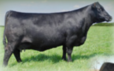
SAV ELBA 801 - Dam of Lots 31 and 32 and full sister to Lot 28.