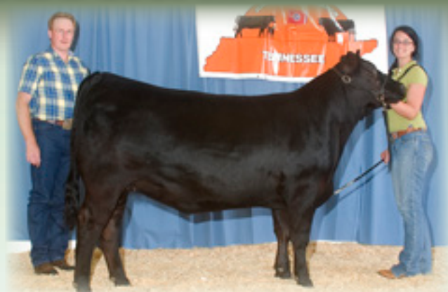
CHAMPION HILL GEORGINA 7135 - Dam of Lot 123.