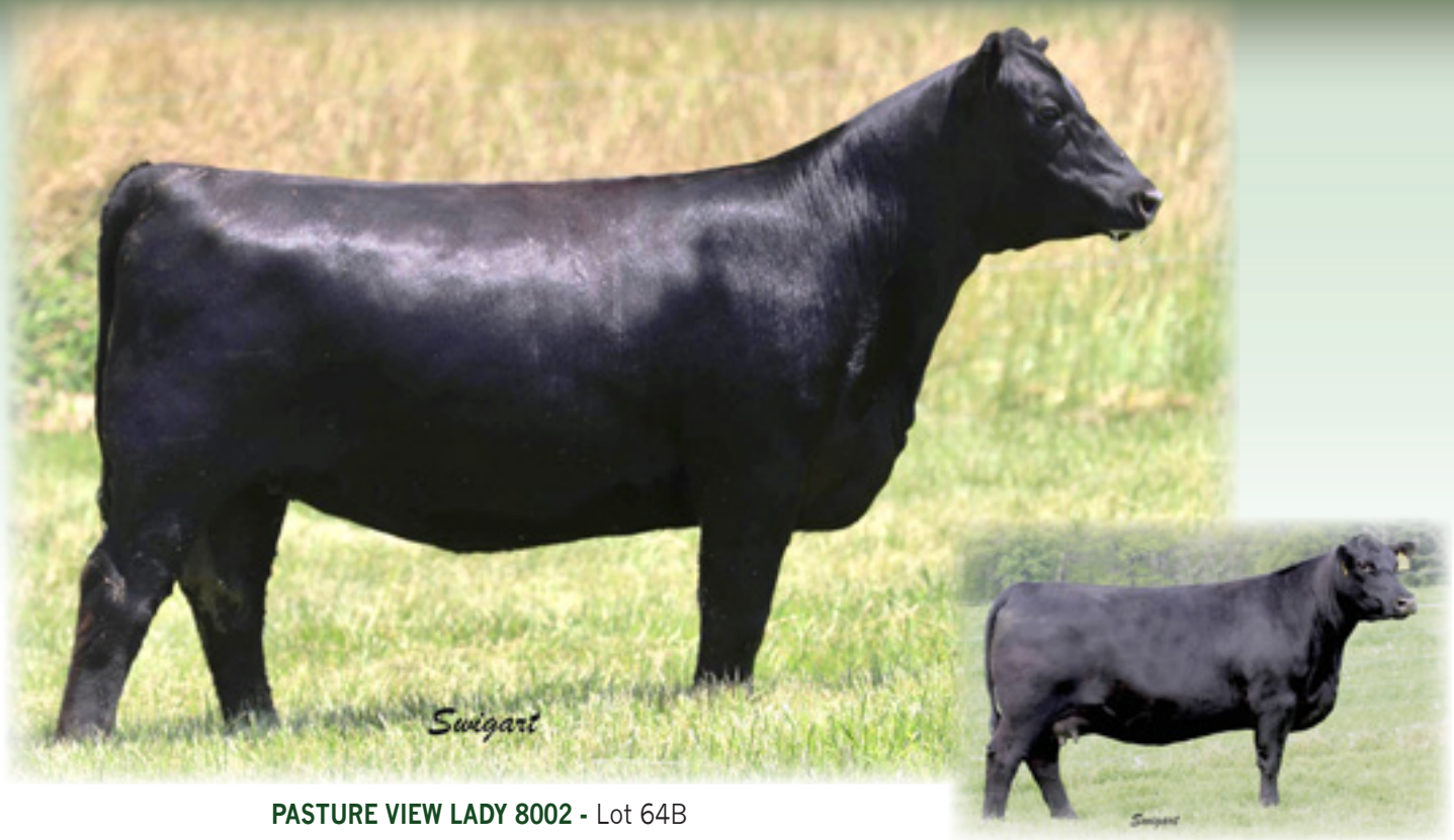
PASTURE VIEW LADY 8002 - Lot 64B