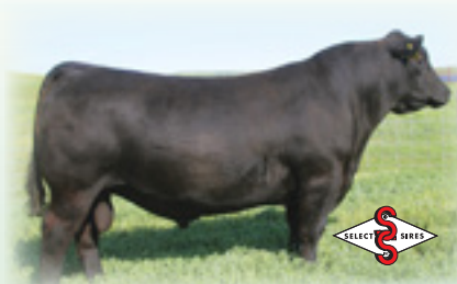
SAV SUPERCHARGER 6813 - $235,000 maternal brother to the dam of Reference Sire B.