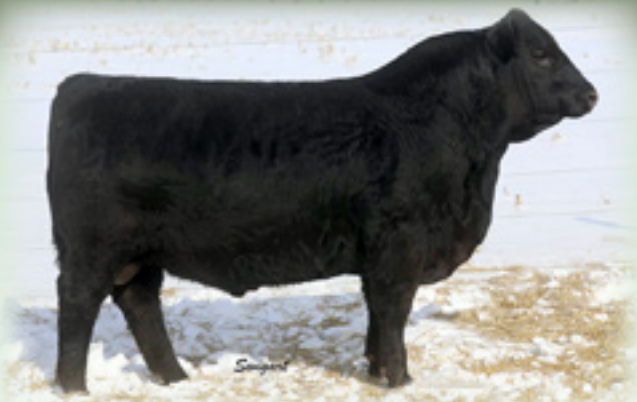
PVA LEGENDARY D881 - This top-selling son of Lot 45 is a full brother to Lots 46-48, from the Emblynette family.