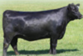
PVA BLACKCAP MAY E445 - $10,000 maternal sister to Lot 17, 17A and 17B and flush sister to the dam of Lot 19.