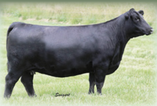
PVA BLACKCAP MAY F697 - Lot 10