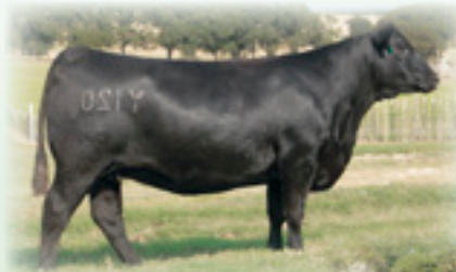
DEAN'S QUEENIE Y120 - $600,000 valued full sister to the dam of Lot 112.