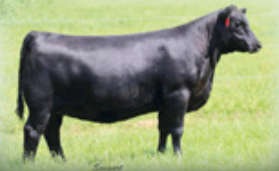
PASTURE VIEW MISSIE 7122 - $4,000 granddaughter of Lot 127.