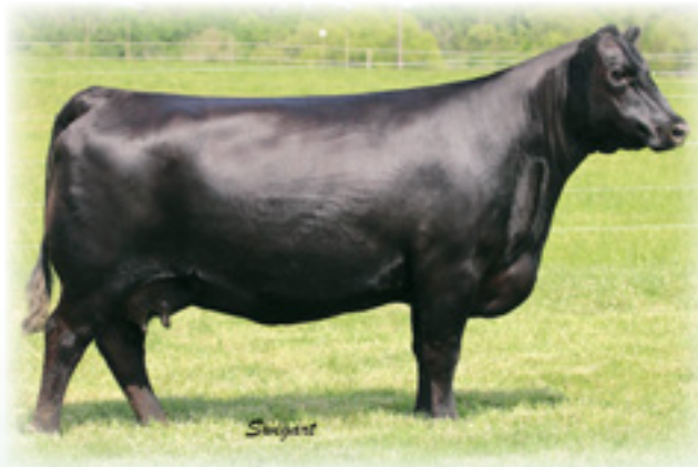
SAV ELBA 910 - Lot 21