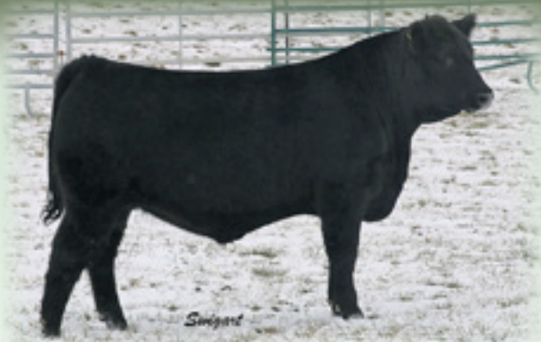
PVA ANGUS VALLEY 4234 - $12,500 son of Lot 215 and maternal brother to Lot 216.