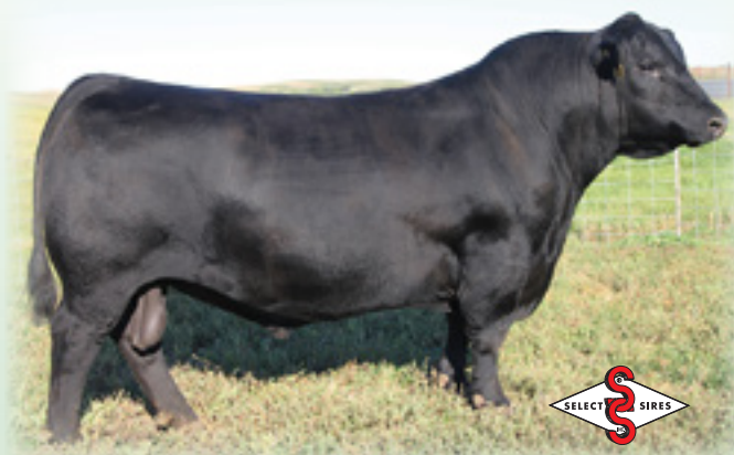
SAV RECHARGE 3436 - Sire of Reference Sire B.