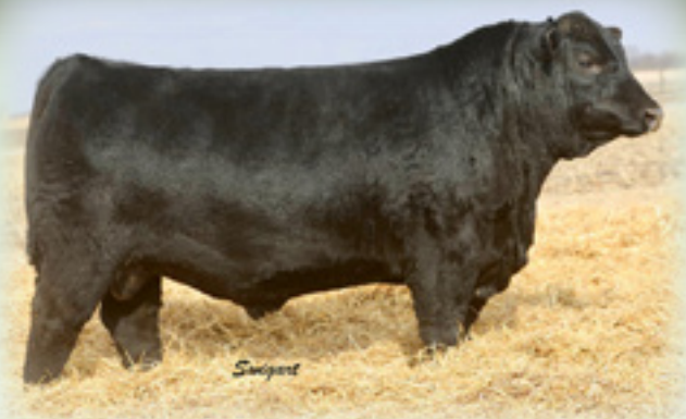
PVA ANGUS VALLEY 7143 - $8,000 son of Lot 198.