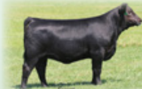
PVA BLACKCAP MAY J545 - $10,000 flush sister to the dam of Lot 18.