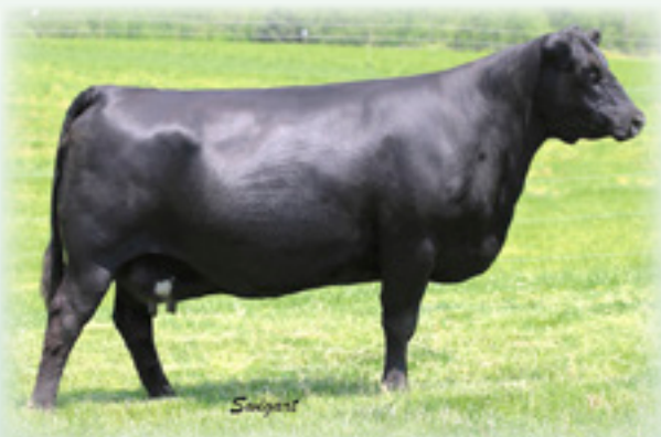
PVA LADY PRIDE 8310 - Maternal sister to the dam of Lot 194.