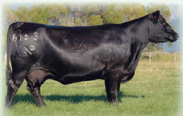
COLEMAN DONNA 6153 - Grandam of Lot 155.