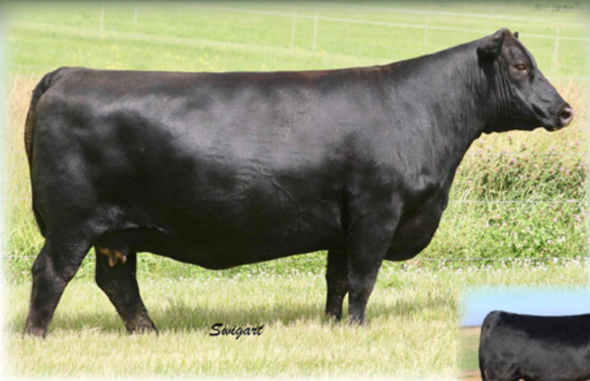
PVA EMBLYNETTE 2181 - Lot 45