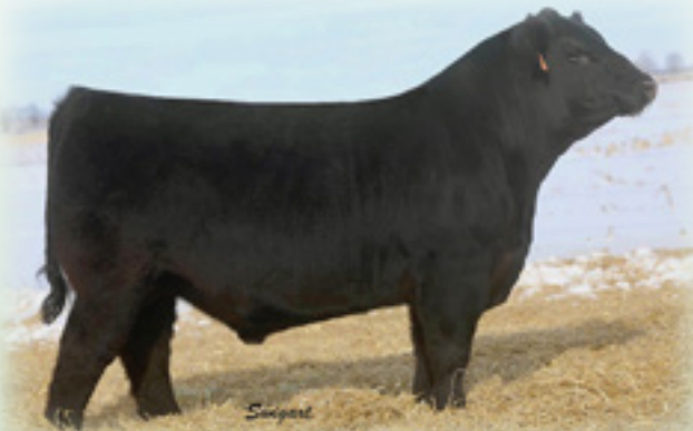
PVA CUTTING EDGE 8095 - This $6,300 son of Lot 134 is a full brother to Lot 134A and maternal brother to Lot 135.