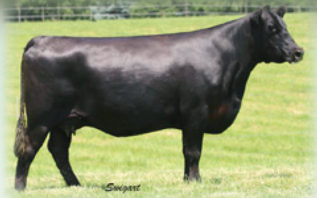
PASTURE VIEW RITA 1159 - Lot 186