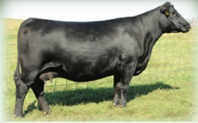
SAV BLACKCAP MAY 8962 - Dam of Lots 7 and 8.