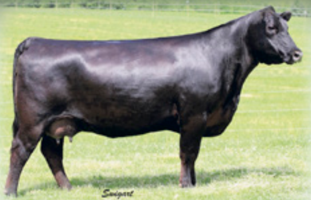
SAV ELBA 1810 - $20,000 dam of Lot 25.