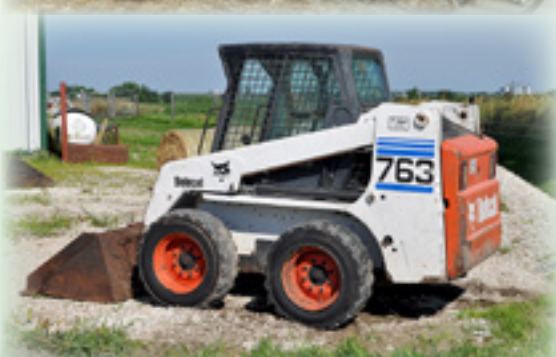
Bobcat 763 skid loader