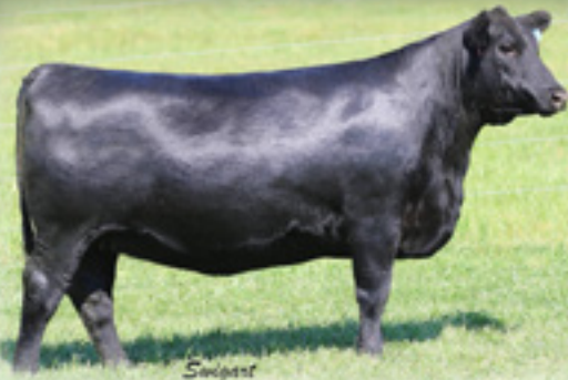
PASTURE VIEW OAKLEAF 4251 - Daughter of Lot 207 and maternal sister to Lot 208.