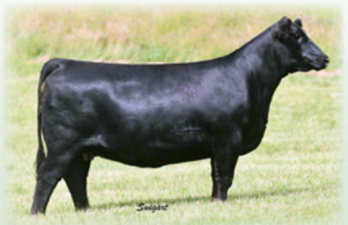
PVA BLACKCAP MAY 797B - Lot 4