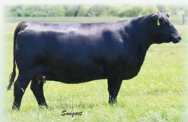
MINDEMANN KEM A25 - Grandam of Lot 210.