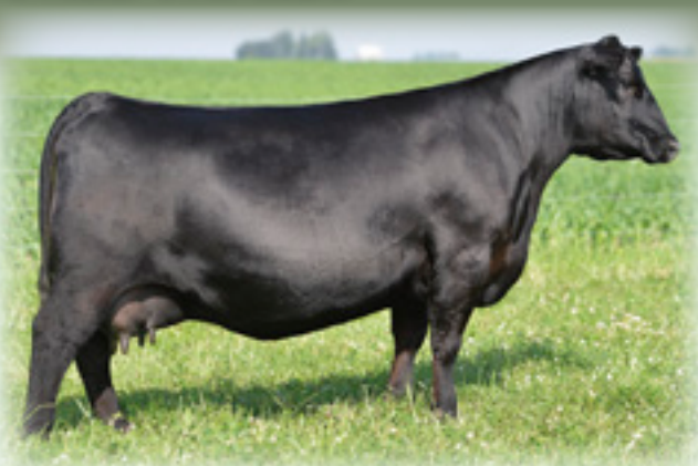
SAV ABIGALE 101 - Dam of Lot 40.