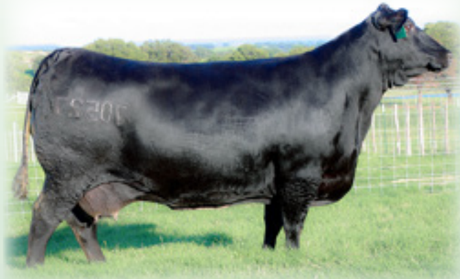
RODEN RL QUEENIE 70527 - The $102,000 grandam of Lot 112.