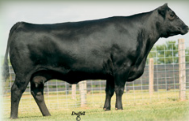
TC BLACKBIRD 7049 - Pathfinder third dam of Lot 138.