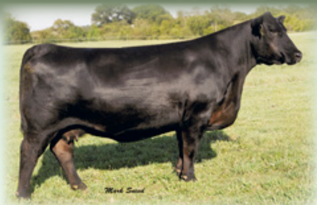
WERNER BLACKBIRD 56 - Dam of Lots 163, 164, 166, 169 and 170.

163 PASTURE VIEW BLACKBIRD C456 Birth Date: 1-13-2014 Cow +17859891 Tattoo: C456 #* SAV Iron Mountain 8066 #TC Gridiron 258 SAV Angus Valley 1867 [RDF] SAV Madame Pride 3249 #+*17016630 #+SAV May 2397 #+SAF 598 Bando 5175 SAV May 7238