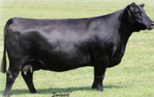
PVA LADY OAKLEAF 9151 - Pathfinder Dam of Lot 207 and grandam of Lot 208.