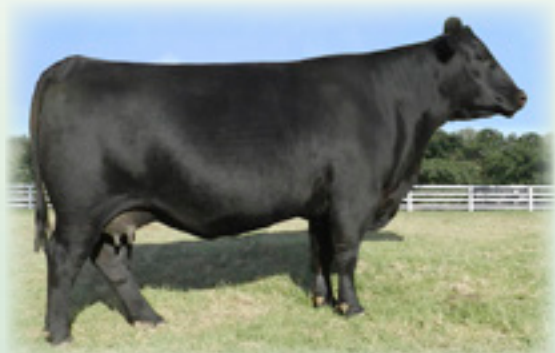
SANDPOINT BLACKBIRD 8809 - Maternal sister to the dams of Lots 161-162.