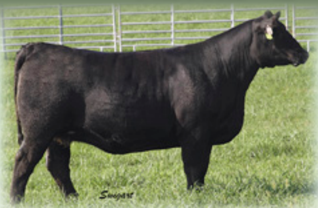
PASTURE VIEW BLACKCAP D384 - This $14,750 flush sister to Lots 173 and 174 is a maternal sister to Lots 171, 172, 175 and 179.