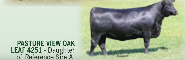
PASTURE VIEW OAK LEAF 4251 - Daughter of Reference Sire A.