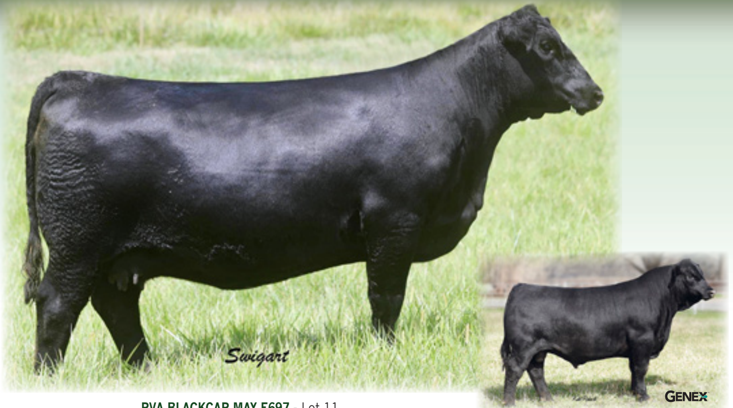
PVA BLACKCAP MAY E697 - Lot 11