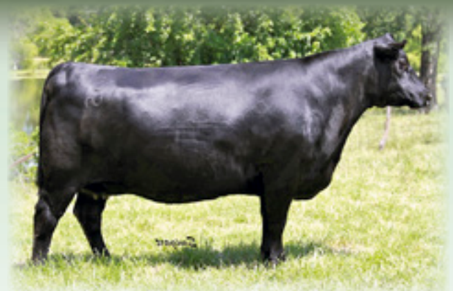
SAV BLACKCAP MAY 7872 - $25,000 full sister to the dam of Lots 7 and 8.