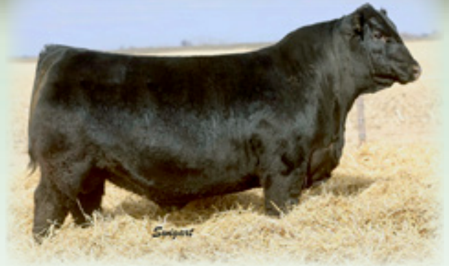
PVA RESOURCE 6907 - $7,500 son of Lot 145 and maternal brother to Lot 145.