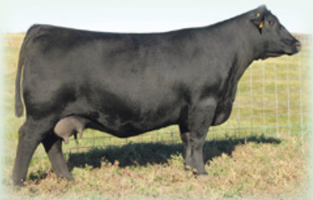
SAV BLACKBIRD 3704 - Dam of Lot 52.