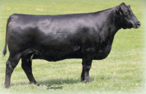
SAV ELBA 7030 - Dam of Lot 34.