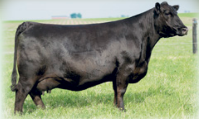
SAV ELBA 171 - $75,000 maternal sister to Lots 31 and 32.