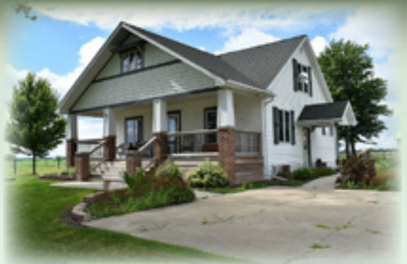
Three Bedroom Home