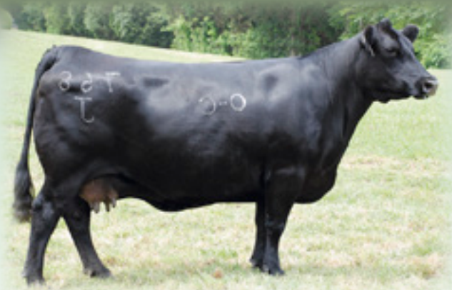
OCC JUANADA 768J - $54,000 dam of Lot 150.