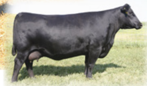
SAV MADAME PRIDE 5290 - Dam of Reference Sire B.