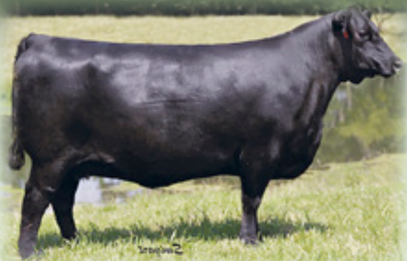
SAV BLACKCAP MAY 8245 - $22,000 dam of Lots 17, 17A and 17B and grandam of Lots 18, 19 and 20.