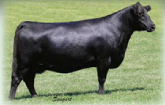
PVA EVERELDA ENTENSE 0367 - Dam of Lot 159