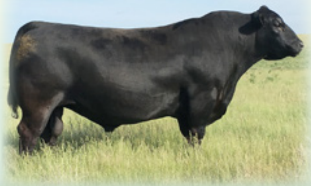
SAV CUTTING EDGE 4857 - Featuring his progeny.