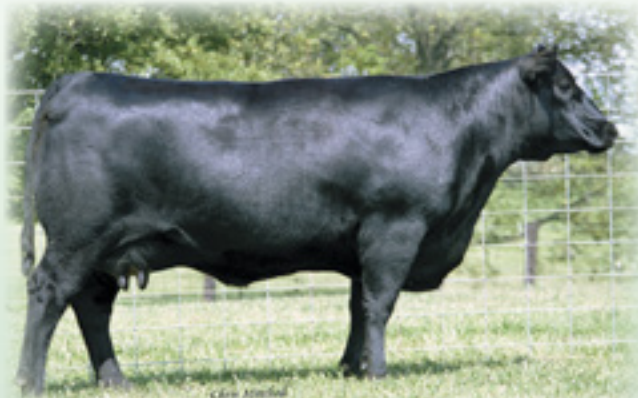
EF FOREVER LADY 585 - Grandam of Lots 146, 147 and 148.

147 PVA FOREVER LADY 2919 Birth Date: 9-16-2012 Cow 17544306 Tattoo: 2919 #SAV 8180 Traveler 004 (RF) #Sitz Traveler 8180