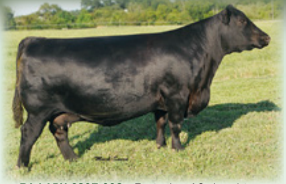
BA LADY 6807 308 - Featuring 19 daughters.