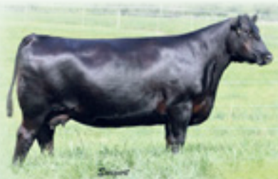
PVA MISSIE 2122 - $5,400 daughter of Lot 127 and maternal sister to Lot 128.