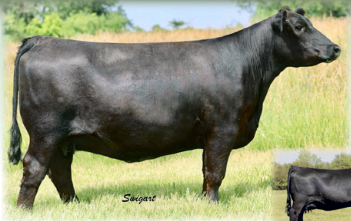
DAMERON AF NORTHERN MISS 7710 - Lot 117