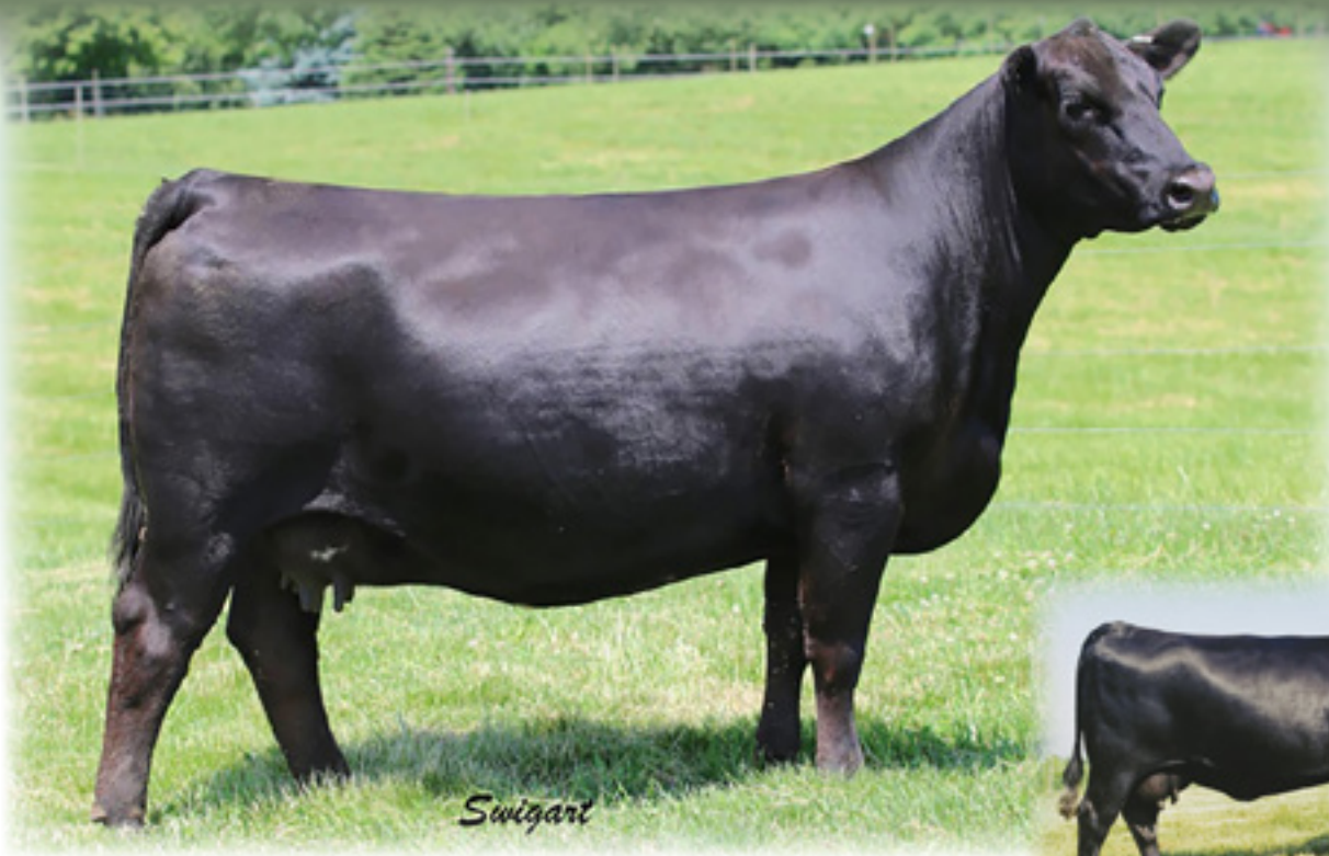
PASTURE VIEW BURGESS 2920 - Lot 140