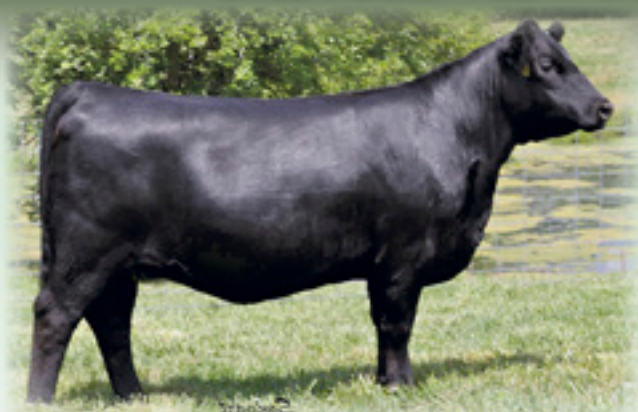
PVA FOREVER LADY 1919 - $9,700 full sister to Lot 146 and maternal sister to Lots 147 and 148.

146 PVA FOREVER LADY C519 Birth Date: 1-8-2015 Cow #18150771 Tattoo: C519 #+SAV Bismarck 5682 (RF) #+*GAR Grid Maker