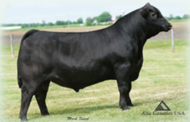
RB CONFIRMED 02-4524 - $160,000 maternal brother to Lots 56-70.