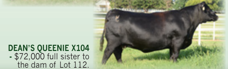
DEAN'S QUEENIE X104 - $72,000 full sister to the dam of Lot 112.