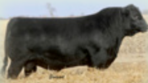
PVA WHIPLASH 6910A - This $7,500 son of Lot 21 is a maternal brother to Lots 21A-24.