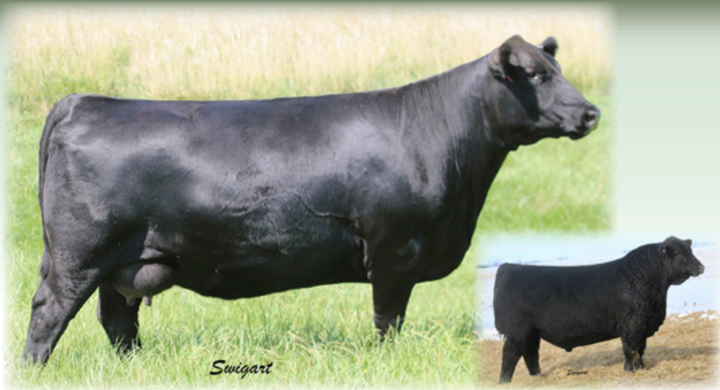
PVA BLACKCAP MAY 4197 - Lot 2