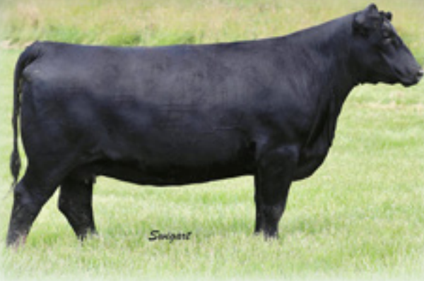
PVA BLACKCAP MAY G697 - Lot 5

5 PVA BLACKCAP MAY G697 Birth Date: 8-20-2016 Cow +*18768345 Tattoo: G697 #*Connealy Consensus 7229 #*Connealy Consensus Connealy Black Granite Blue Lilly of Conanga 16 #*17028963 #Eura Elga of Conanga 9109 #+SAF 598 Bando 5175 (RDF) Eura Cal of Conanga 56B #*SAV Harvester 0338 #*SAV Heritage 6295 PVA Blackcap May 4197 +*SAV Emblynette 7749 +*17867859 #+SAV May 2397 #+SAF 598 Bando 5175 SAV May 7238