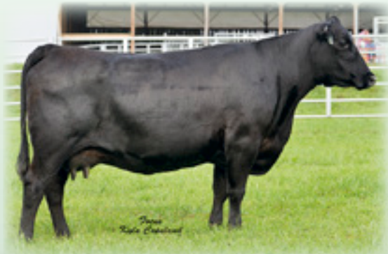
SIEBRING ELBA 234 - $41,000 dam of Lots 27A and 27B.