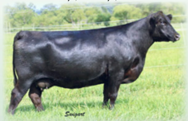
PVA LADY PRIDE 2210 - Maternal sister to Lot 194 and dam of Lot 196.