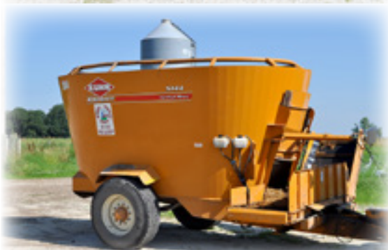
Kuhn Knight 5144 Vertical Maxx mixer feed wagon