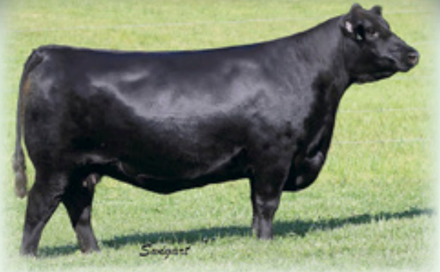
RB LADY STANDARD 305-02 - $120,000 valued dam of Lots 56-70.