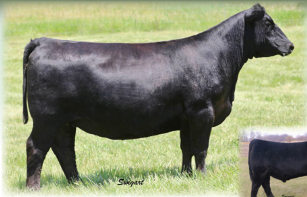
PASTURE VIEW LADY PRIDE 8110 - Lot 194A