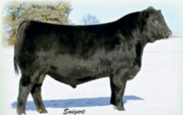
PVA CALL OF DUTY 4159 - $80,000 son of Lot 186 and full brother to Lot 187.