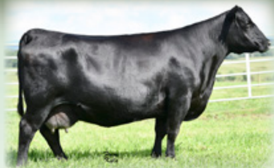
SAV ELBA 918 - $17,000 dam of Lots 26A and 26B.