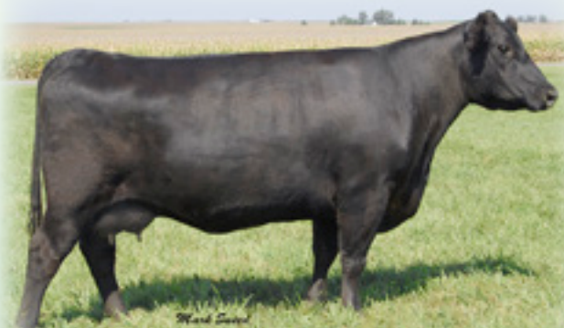
TC PRIDE 8067 - Pathfinder grandam of Lot 139.