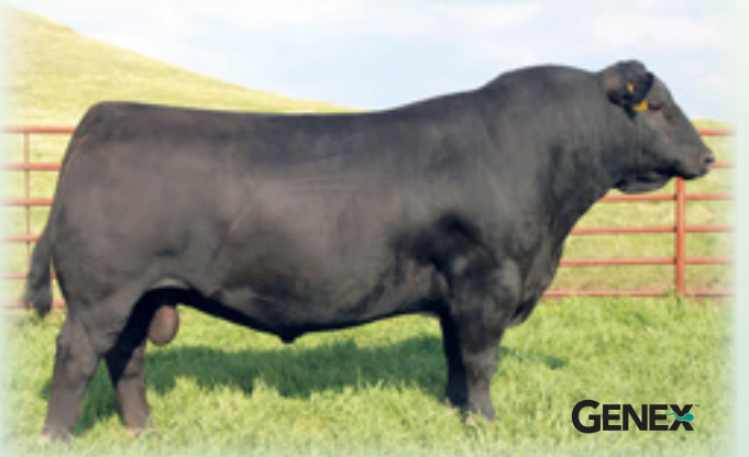
SAV ANGUS VALLEY 1867 - Maternal brother to Lots 1, 2 and 10-14.