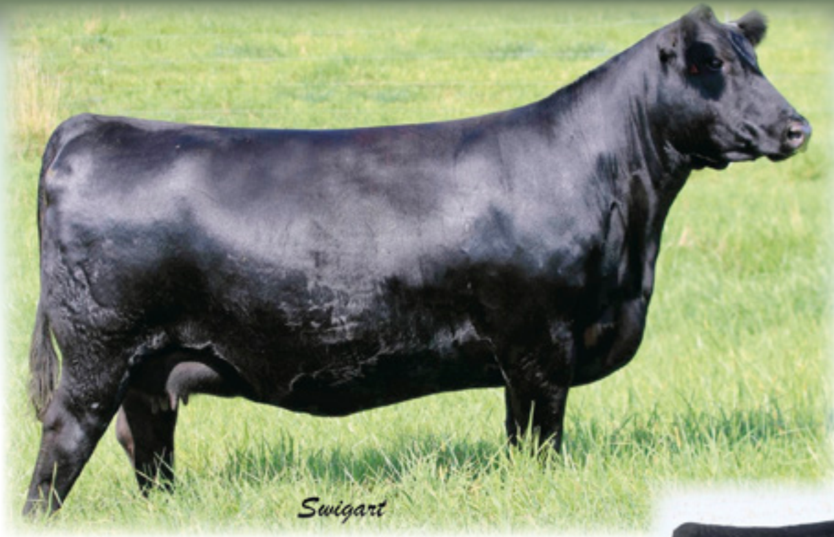
SAV EMBLYNETTE 4603 - Lot 42

42 SAV EMBLYNETTE 4603 Birth Date: 1-27-2014 Cow #*17927236 Tattoo: 4603 #*SAV Iron Mountain 8066 #TC Gridiron 258 SAV Angus Valley 1867 [RDF] SAV Madame Pride 3249 #*17016630 #+SAV May 2397 #+SAF 598 Bando 5175 SAV May 7238