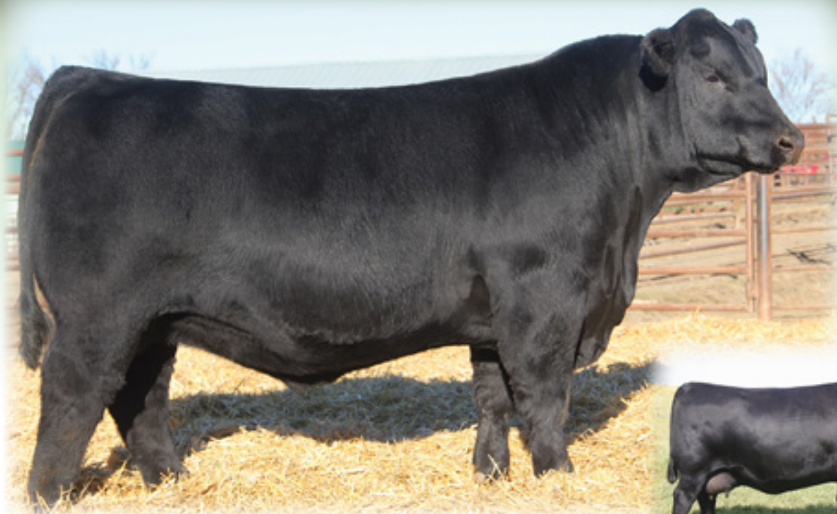
SAV TURBOCHARGER 6882 - Reference Sire B.