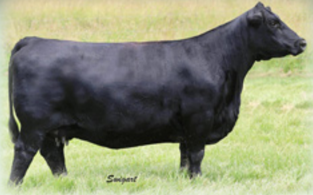
PASTURE VIEW LADY 4908 - Lot 108