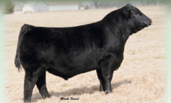
PVA SUPREME JUSTICE 0808 - Selling 19 maternal sisters to this $56,000 top-selling bull.

90 PASTURE VIEW LADY C508 Birth Date: 1-30-2015 Cow +18149228 Tattoo: C508 #* Connealy Onward Sitz Upward 307R #Connealy Lead On #14963730 Sitz Henrietta Pride 81M Altune of Conanga 6104 #Sitz Value 7097 Sitz Henrietta Pride 1370