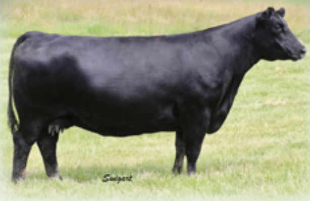
SQR BLACKCAP MAY 7197 - Lot 6

6 SQR BLACKCAP MAY 7197 Birth Date: 1-15-2017 Cow 18773890 Tattoo: 7197 #*EF Complement 8088 #Basin Franchise P142 EF Commando 1366 +EF Everelda Entense 6117 *17082311 Riverbend Young Lucy W1470 #+B/R Ambush 28 +Riverbend Young Lucy T1080 #*SAV Harvester 0338 #*SAV Heritage 6295 WMS Blackcap May 4497 +*SAV Emblynette 7749 +17867861 #+SAV May 2397 #+SAF 598 Bando 5175 SAV May 7238