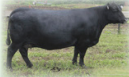
RB LADY CONTRAST 308-850 - Selling 19 maternal sisters to this $32,000 cow.