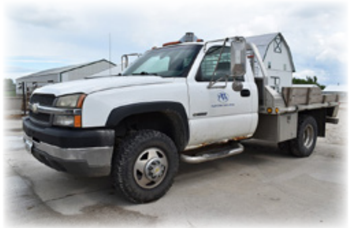
2004 Chevrolet 3500 4wd dually pickup, 6.0L gas