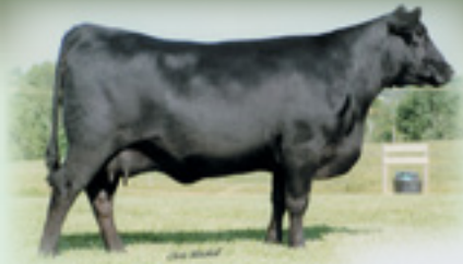
TOEBBEN LUCY 030H - Full sister to the grandam of Lot 144.