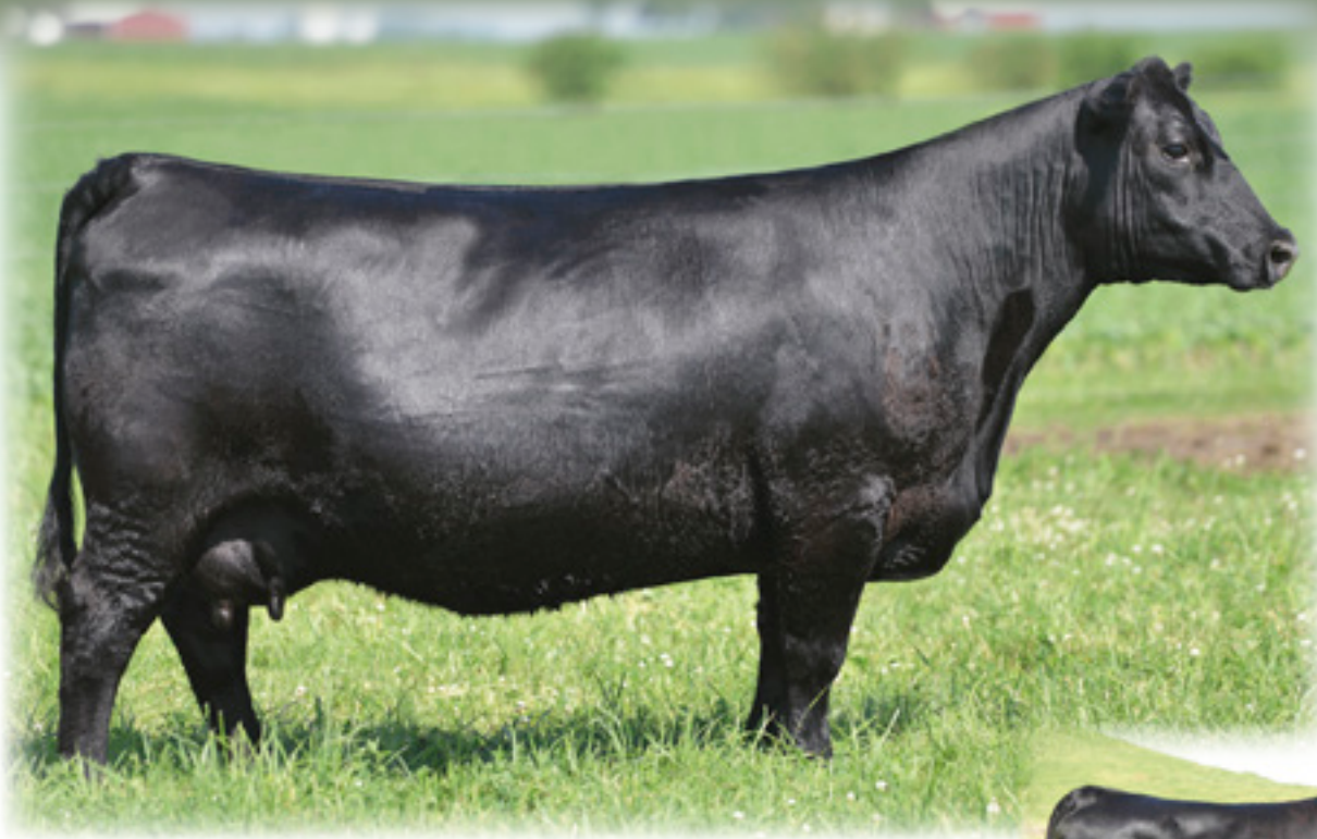
SAV ELBA 900 - Lot 28