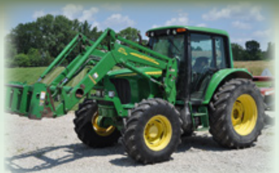
John Deere 6420 MFWD tractor w/ loaders