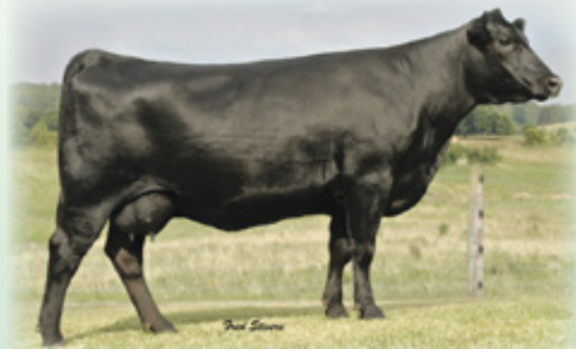
CHAMPION HILL GEORGINA 0042 - Grandam of Lot 124.