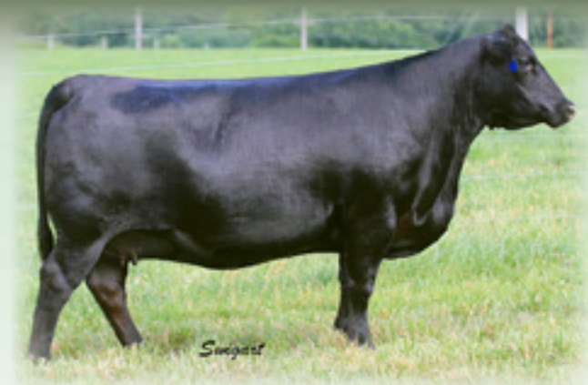
DBL R BAR BLACKCAP MAY Z118 - $45,000 dam of Lot 15.