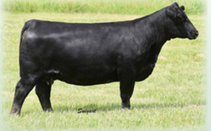
PVA BLACKCAP MAY C697 - Lot 13