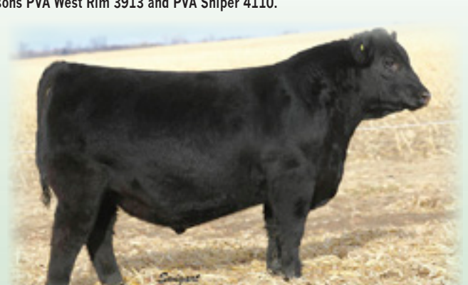
PVA SIR LANCELOT 7210 - $5,000 son of Lot 197.