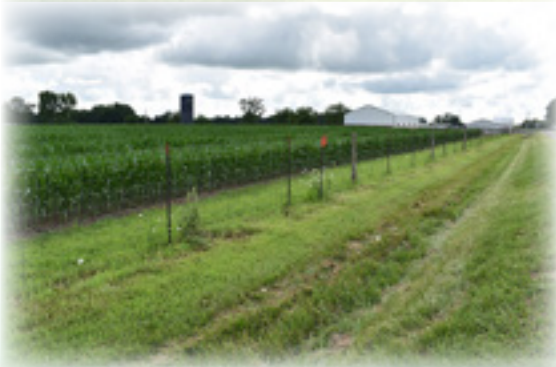
Productive Farm Land