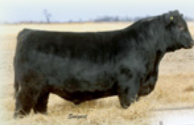
PVA EINSTEIN L802 - Full brother to Lots 61, 62 and 62A.

• Maternal siblings include an impressive array of top-sellers from the high income-producing RB Lady Standard 305-02.