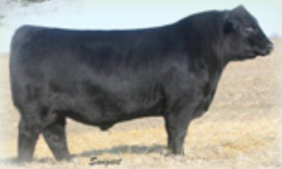
PVA ANGUS VALLEY A422 - $13,000 son of Lot 127 and full brother to Lot 128.