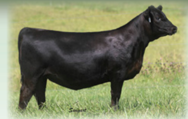
PASTURE VIEW LADY B801 - Daughter of Lot 73 and maternal sister to Lots 74-77.