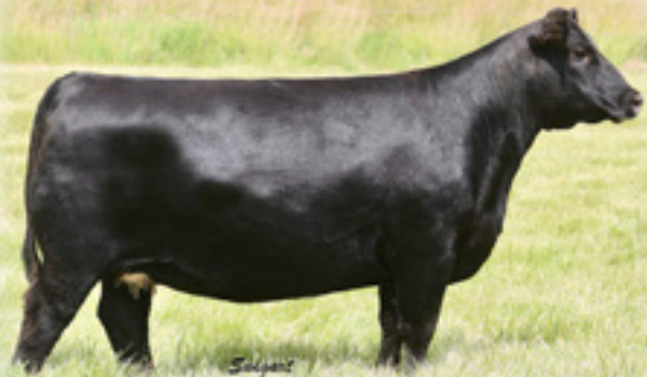
PASTURE VIEW EMBLYNETTE 7281 - Lot 47

The granddam is the third-generation Pathfinder Dam featured as Lot 45.