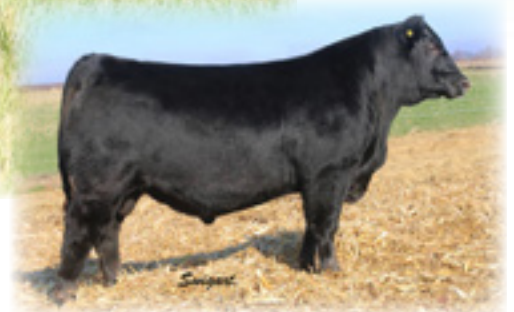
PVA PURSUIT 5181 - This $9,500 son of Lot 45 is a maternal brother to Lots 45A-49.