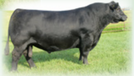
SAV HARVESTER 0338 - Produced from a maternal sister to Lot 51.