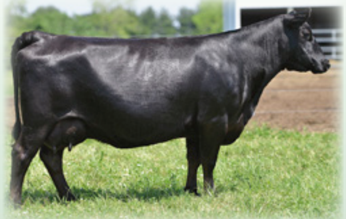
SAV ELBA 102 - $10,000 daughter of Lot 28.

• The dam of this bull has progeny IMF and ribeye ratios of 117 and 103, respectively on eight calves.