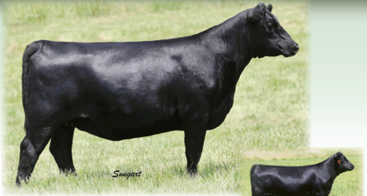
PVA BLACKCAP MAY B897 - Lot 1A

1A PVA BLACKCAP MAY B897 Birth Date: 2-20-2018 Cow +*19177165 Tattoo: B897