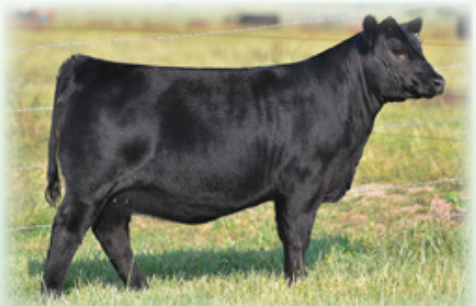
TOP LINE LADY 7012 - Daughter of Lot 118.