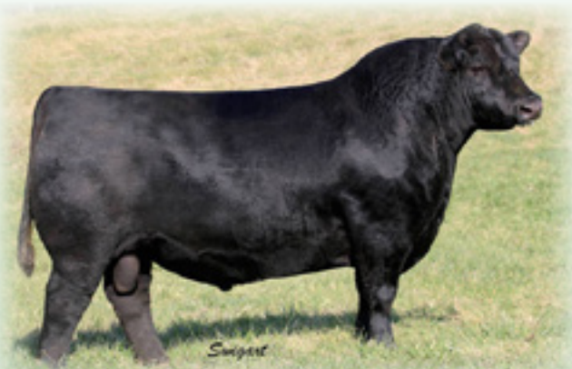
PVA GENERAL JACKSON E308 - Full brother to Lots 82, 88 and 90.