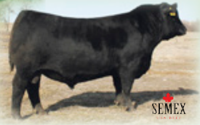
SAV RADIANCE 0801 - $23,000 maternal brother to Lots 31 and 32.