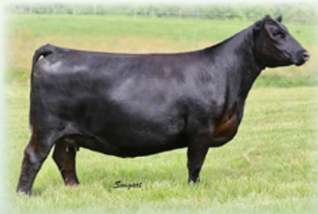
PASTURE VIEW BURGESS 7120 - Lot 141