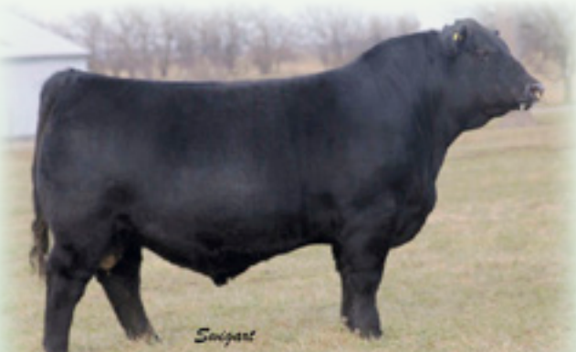
PVA HITCHCOCK 3942 - $19,000 full brother to Lot 202.