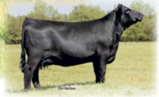
DAMERON NORTHERN MISS 0109 - Dam of Lot 117.