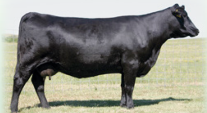
SAV MAY 2397 - Pathfinder Dam of Lots 1, 2 and 10-14.