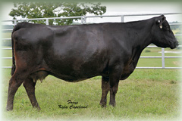
SITZ HENRIETTA PRIDE 151K - Pathfinder Dam of Lot 154.