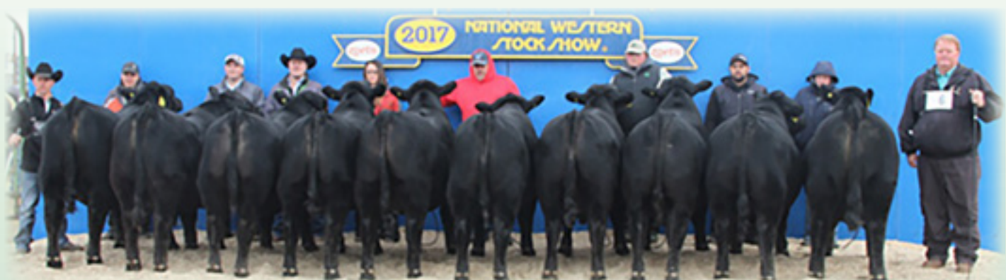
2017 NW CARLOAD