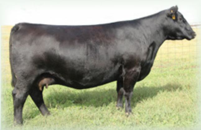
SAV BLACKCAP MAY 9130 - Dam of Lot 16-16D.