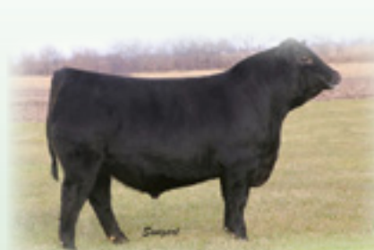
PVA HIGH NOON G445 - Son of Reference Sire A.