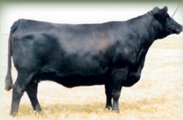
TC RUBY 9095 - Pathfinder grandam of Lots 134 and 136.