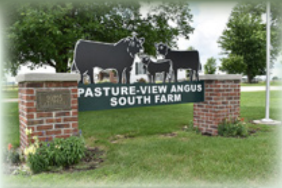
Pasture View Angus South Farm