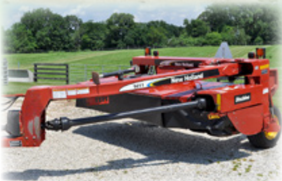
(2) New Holland 1411 discbines