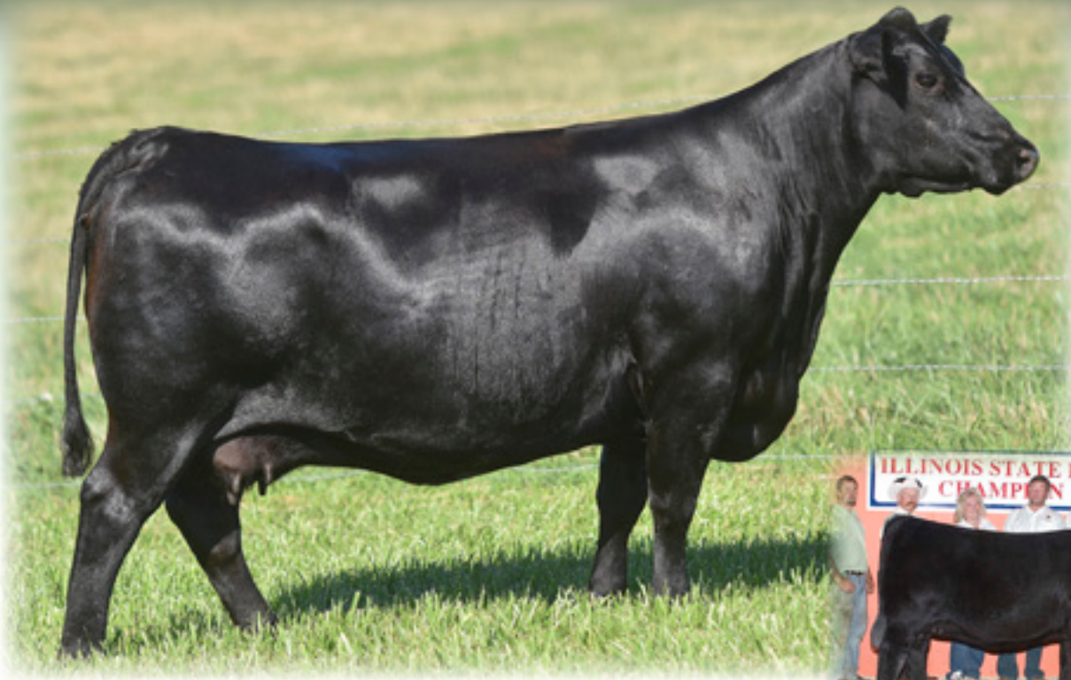
TOP LINE LADY 1153 - Lot 118