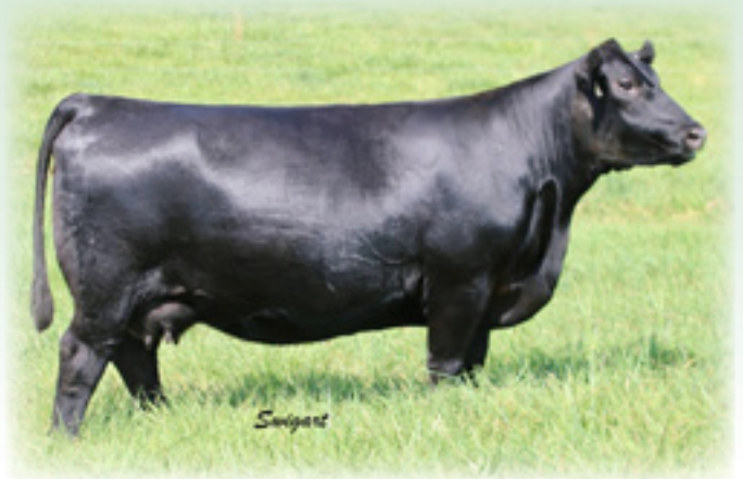
PVA BLACKCAP MAY 4397 - Lot 1