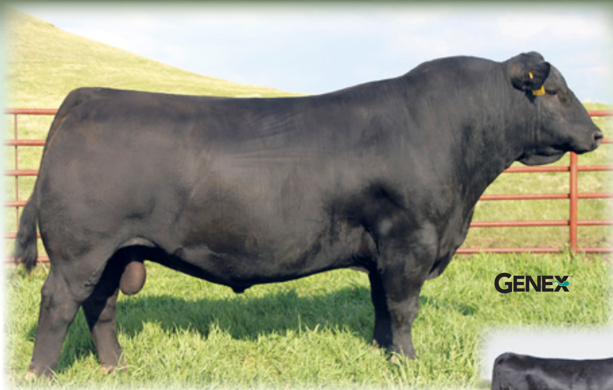
SAV ANGUS VALLEY 1867 - Reference Sire A.