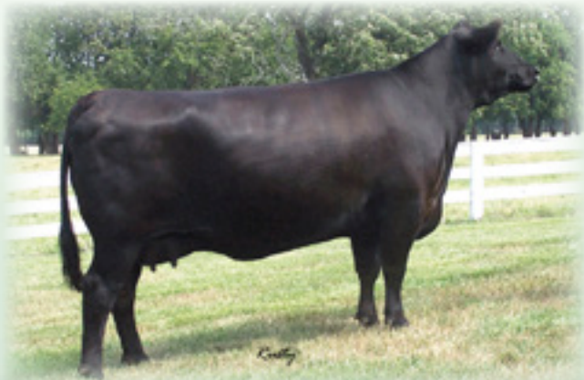
WAF MISSIE 3137 - From the same family as Lots 127-133.