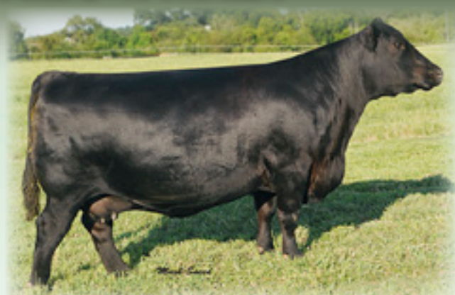
BA LADY 6807 308 - Featuring 19 daughters.