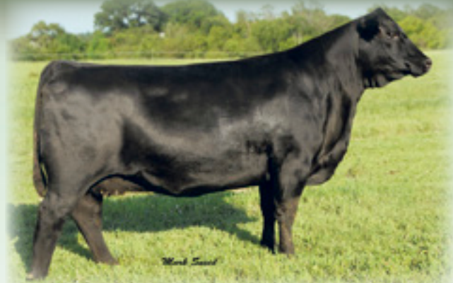
PVA MATRIX BEAUTY 8273 - $11,000 full sister to Lot 211 and to the dam of Lot 212.