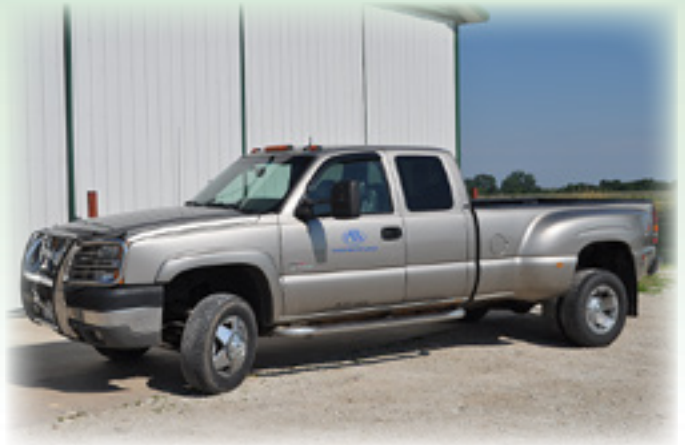
2003 GMC 3500 4wd dually pickup, Duramax diesel