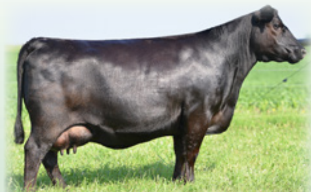
SAV ELBA 110 - This $22,000 daughter of Lot 21 is a maternal sister to Lots 21A-24,