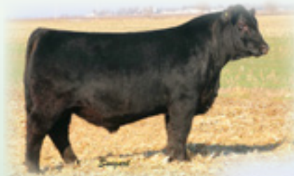
PVA PRIORITY 5125 - $11,000 son of Lot 37.