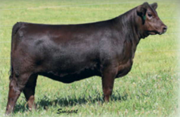
PASTURE VIEW ELBA 5710 - This $40,000 daughter of Lot 21 is a full sister to Lot 24 and a maternal sister to Lots 21A-23B.