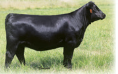
PVA BLACKCAP MAY 8297 - This $8,000 daughter of Lot 1 is a maternal sister to Lots 1A-1D.