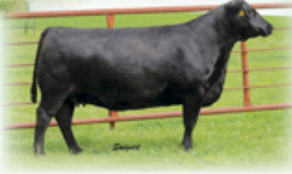
RB LADY STANDARD 305-216 - Granddam of Lot 79.