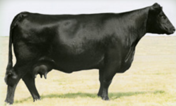
WAF RALLY MISSIE 554 - Featuring her influence.