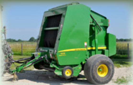
2015 John Deere 569 round baler