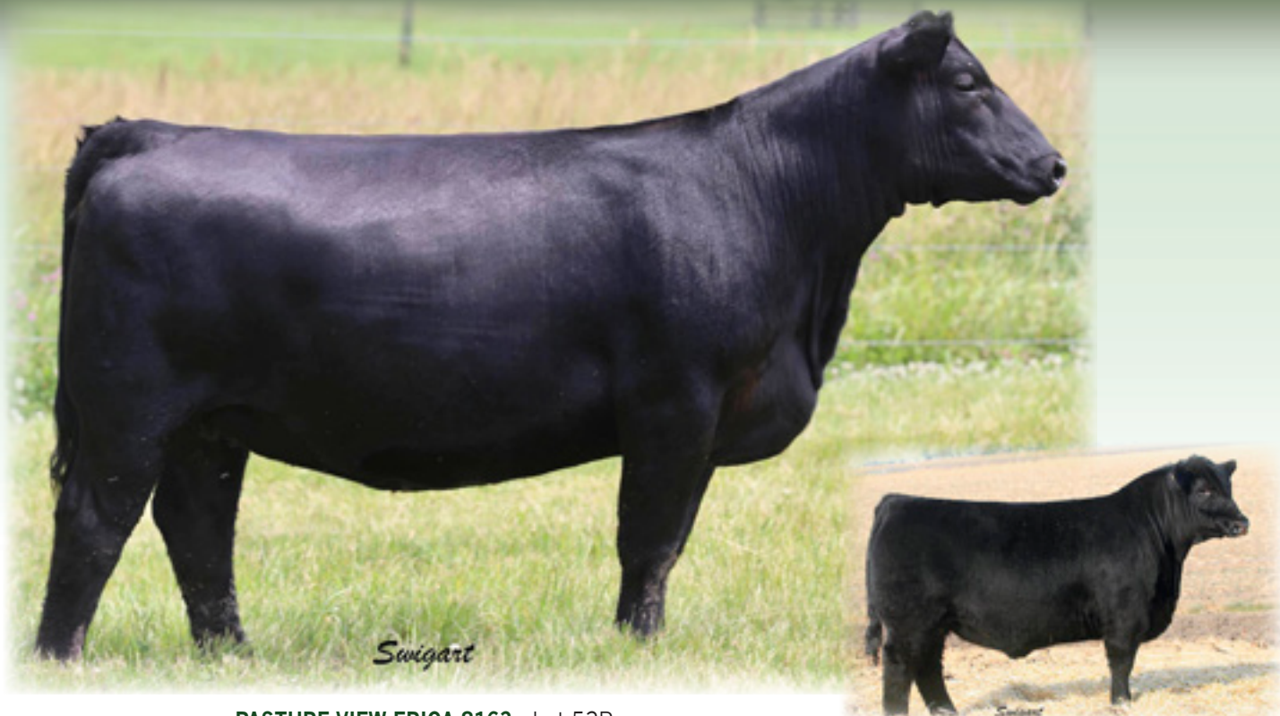
PASTURE VIEW ERICA 8163 - Lot 53B