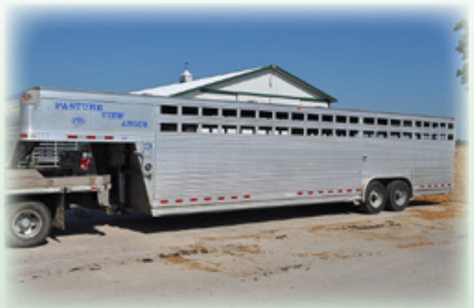
Eby 8'x 28' gooseneck aluminum livestock trailer