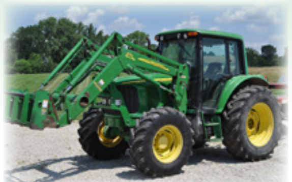
John Deere 6420 MFWD tractor w/ loaders