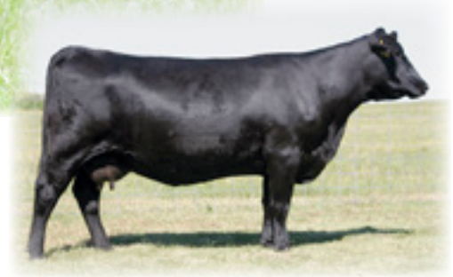
SAV MAY 2397 - Pathfinder Dam of Lots 1, 2 and 10-14.