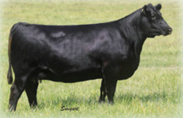
PASTURE VIEW ELBA E610 - Flush sister to Lot 24.